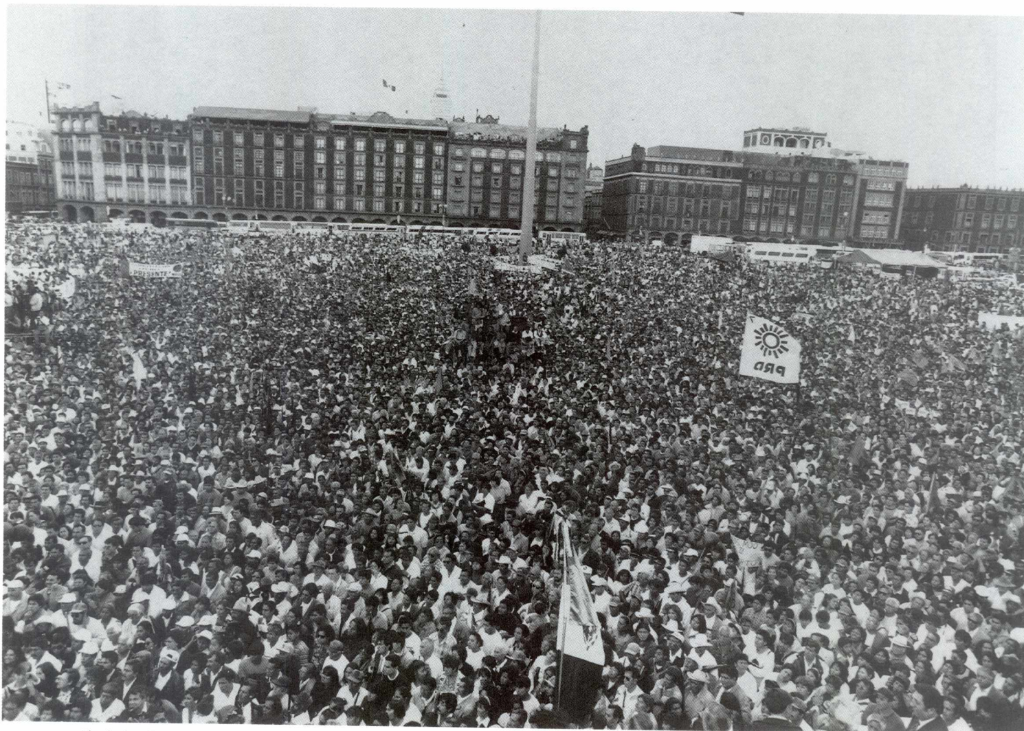
The kick-off of the Cárdenas campaign at Mexico City's central Zócalo square.

corruption in the capital's public administration, replacing the old way with honest, effective, republican government understood by the people.