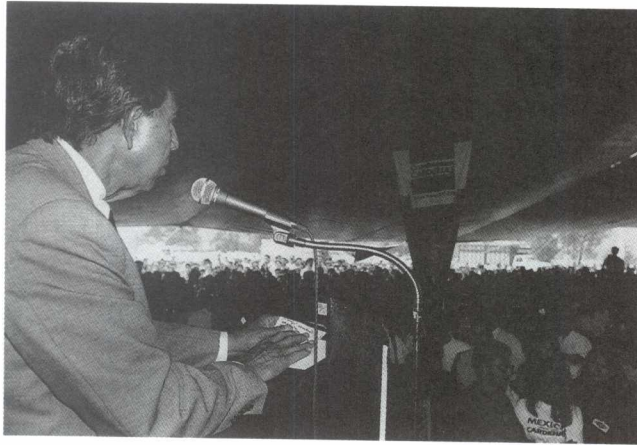
Cuauhtémoc Cárdenas at Mexico's City Sports Center.

before becoming a federal district, it was the center of political decision making. But it is the only part of the country with a special form of government, which means that its inhabitants, and particularly its citizens, 1 have been deprived of their full constitutional rights.