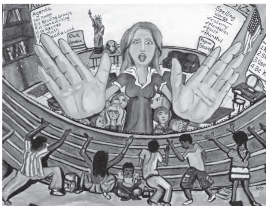
Chris Faltis, No More Borders vs. No More Immigrants (2008) (Faltis, 2012).

Intertwined with critical discourse analysis, critical race theory (CRT), developed through the work of U.S. legal scholars, has been applied to educational research as well as other fields. It articulates a set of interrelated beliefs about the significance of race and racism as it operates in contemporary educational institutions and policies (Ladson-Billings and Tate, 1995; Ladson-Billings, 2005; Tate, 2005). CRT scholars such as Derrick Bell (1992) explore the multiple ways that U.S. law, politics,