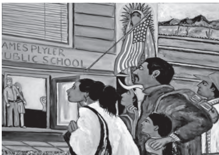
Chris Faltis, Plyler Rights for Immigrants (2010) (Faltis, 2012).

As illustrated by Chris Faltis (2012: 12) in Figure 1 above, radical right-wing groups in the U.S. frequently attempt to overturn Plyler v. Doe , a Supreme Court decision that provides undocumented students with equal rights to K-12 education. Very recently, state legislators have attempted to make access to schooling more difficult for undocumented students by ensuring that they needed to show their papers when registering for school (for example, in Alabama). 1 As Faltis explained about