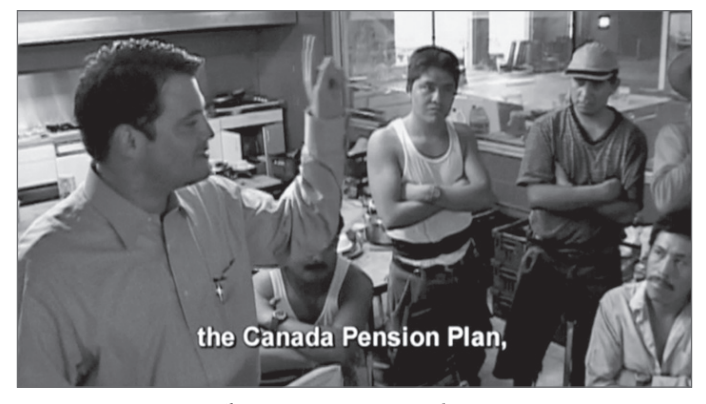
El Contrato. Dir.: Min Sook Lee.

Interwoven throughout the plot, the masked Mexican man, M., testifies to the mistreatment at some farms and the paradox in which the workers must live: anonymity is the only way to make a complaint, because opinions or grievances are considered signs of rebellion. Therefore, they lead directly to expulsion from the program, a luxury these men cannot afford if they want to continue participating in it in order to make a living earning their wages in dollars.