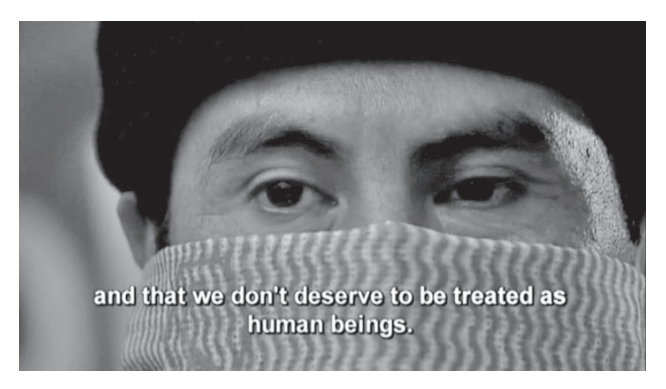
El Contrato. Dir.: Min Sook Lee.

Even though this is not the general tone of the film, as an irony, utilizing fragments with archive images of the Tomato Festival, with only white attendees, one of the sequences in the documentary is scored by Stompin' Tom Connors's "The Ketchup Song" (1970), giving it a certain temporal ambiguity: the spectator is never sure if these are scenes from the past, when tomatoes were harvested by Ontarians, or if the festivity is contemporary to the film narrative and Mexican workers are not welcome to join in, even though it would be impossible without their active participation.