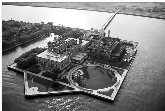
Figure 1 ELLIS ISLAND IN 2016, NEW YORK