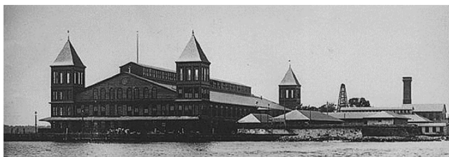
Figure 3 ELLIS ISLAND IMMIGRATION STATION (1892-1897)

the demolition of some buildings, it restored others previously used for military purposes. The government's aim was to ensure the opening of the Ellis Island Immigration Station in January 1892, that is, less than a year after the Immigration Act of 1891 came into force (Figure 3).