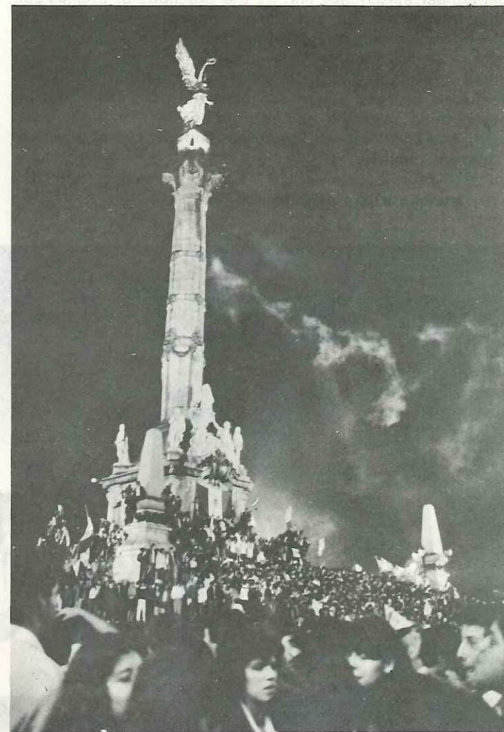
Celebration at the Independence Monument.

"We are kind of proud that the World Cup was held here, but all of us street vendors were hurt because we payed for permits, work clothes and name tags, and they won't let us work. It's not fair, we've been here since the Azteca was built. We thought the games would benefit us; all of us would like to be in the stadium, but we can't go in because it's too expensive. The way things stand, how are we going to cheer our team on?"