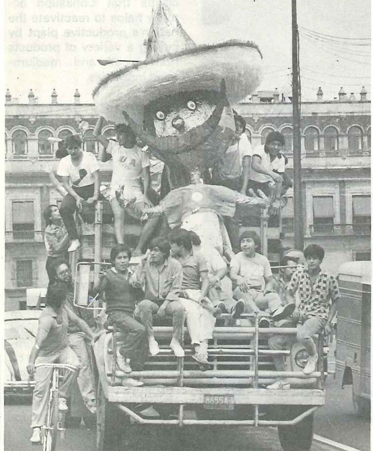
"Pique", official emblem of the World Cup, parades through Mexico City.

Mexican music blared from car radios and household stereos. Many wore typical Mexican dress, while others, both men and women, painted their cheeks or even their whole face, with the colors of the Mexican flag. People of all ages joined the