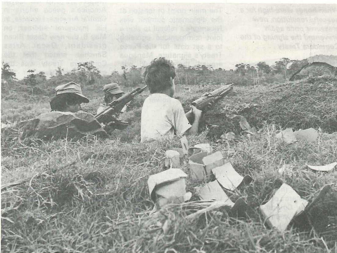
Nicaraguan children defending their national sovereignty.

As for the Panama Declaration, the document states three basic commitments: Central American nations will neither lend their territory nor support irregular