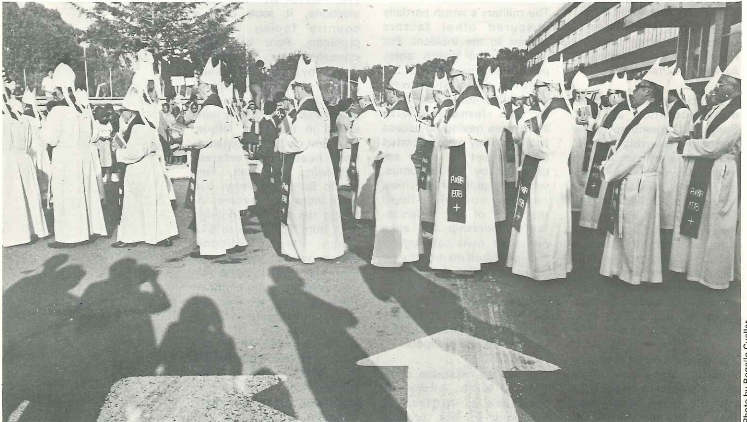
Which way the Church?

Clearly this authentic manner of living and preaching the Gospel represents hope for the poor, the majority of people in the continent, but it also questions those who