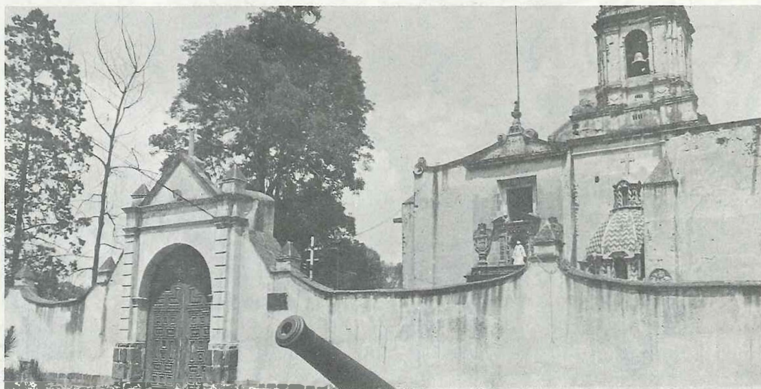
The front of the Museum of Interventions