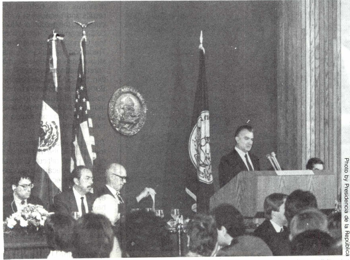
President De la Madrid fencing at the National Press Club in Washington D.C.

This high frequency of encounters is explained by the close ties between neighbors, starting with a 3,000 kms. common border. Mexico sends 67% of its exports to the U.S., including 60% of the crude oil it sells abroad, and 70% of our imports come from the United States. It has been estimated that by 1985 close to 10 million Mexicans had migrated north in search of work, giving rise to labor problems on either