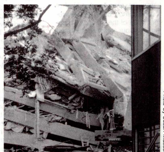
Some 300 apartments went down in the Nuevo León building, which became a symbol of the earthquake's victims.