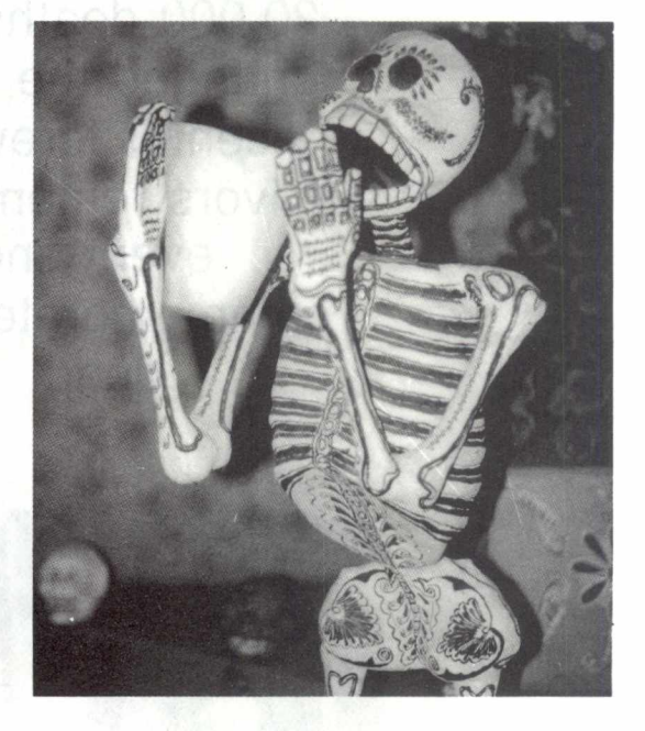
Death in Mexico, as elsewhere, is loss and pain. It is also celebration and humour.