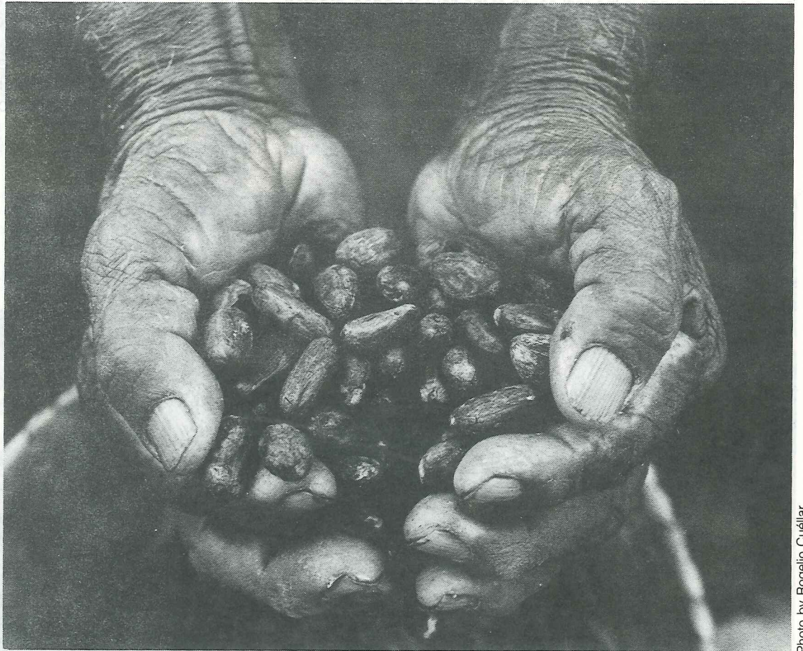
Cacao beans. Fields are producing less and less

The countryside has fallen way behind the development of the rest of the nation. The development model based on rapid industrialization that as of the 1940s spearheaded economic growth, allowed Mexico to recover strategic industries previously controlled by foreign-owned firms. Likewise, the development of