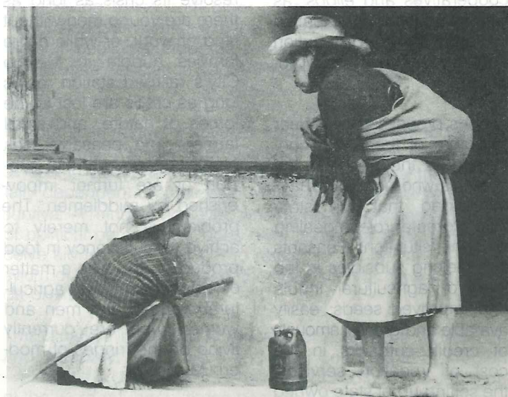
Two campesinos from the Puebla mountains

For its part, the Independent Farm Workers and Peasants' Central (Central Independiente de Obreros Agrícolas y Campesinos) made public their disagreement with the new indirect taxes being levied on peasants through increased prices and tariffs of goods and services provided by the government.