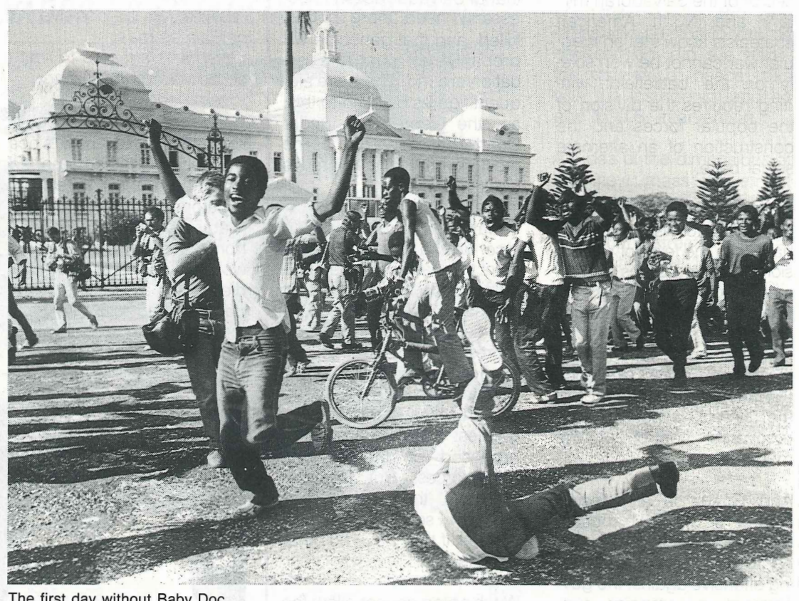
The first day without Baby Doc

etons of political prisoners had been found—into a monument to Duvalier's victims. The government refused to sanction the march and sent in the army to fire on demonstrators. Six people were killed and many more wounded. People understood this as an expression of the attempts to re-establish "Duvalierism." From that day on, people have firmly maintained their own demands