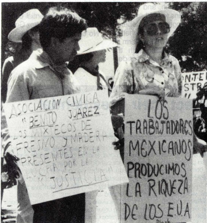
"Mexican workers produce US wealth"

Nevertheless, it has been estimated that there are some six