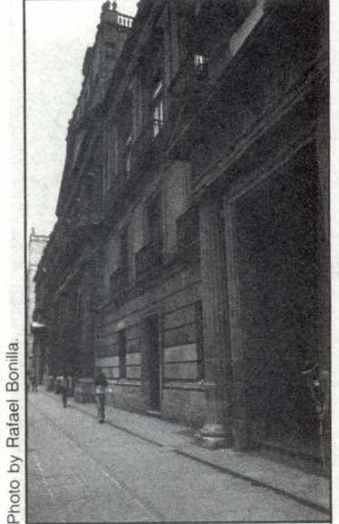
Palacio de Minería ( formerly Engineering College), downtown

Insofar as the university offers the opportunity for ideological struggle, there are academic issues which have not been given their due importance. These have to do not only with the crisis of capitalism, with the threat of war, with