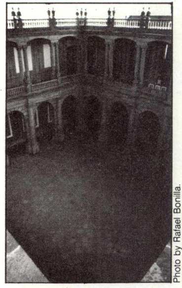
Interior, Palacio de Minería.

In all militarist and neo-fascist states, university teaching and research structures are plunged into crisis and practically destroyed. The social sciences constitute the chief target for attack. In several Latin American countries, social science departments have been closed down, the books burned, the teachers per-