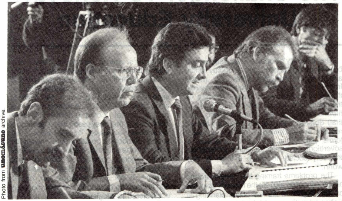
Rector's Office commission.

discussions. CEU reiterates its rejection of Rector's