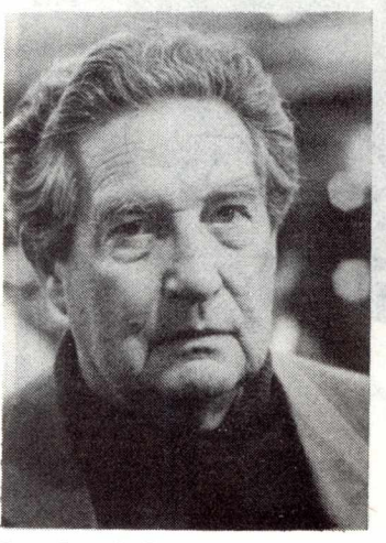
Poet Octavio Paz.

With the consolidation of the revolution during the presidency of Lázaro Cárdenas (1934-1940), Mexico became the meeting place for the vanguard of the international art world. Extraordinary things were included in a recent exhibition of surrealism in Mexico, held in the imposing National Museum — just a few blocks away from the Great Temple. There were photographs of the enormous and mysterious surrealist city built in the depths of the jungle by English millionaire aristocrat Ed-