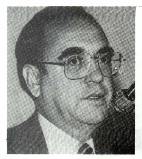
Héctor Hernández Cervantes, Minister of Trade and Industrial Development.