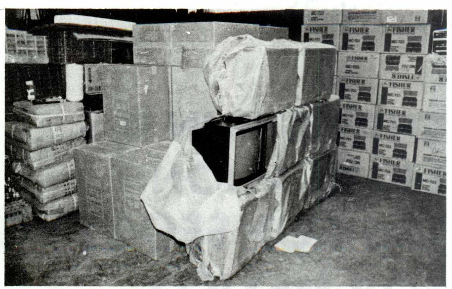
U.S. merchandise confiscated by Mexico's Customs Office.