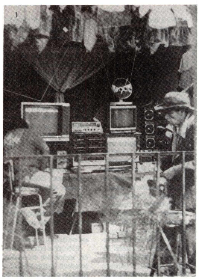
Contraband goods being sold in Tepito market in Mexico City.

Democrats for the Wall Street crash, saying that it was caused by the "panic produced by Democratic Party proposals calling for tax increases." Democratic Congressmen Jim Wright and Dan Rostenkowsky called Baker's comments "absurd and ridiculous."