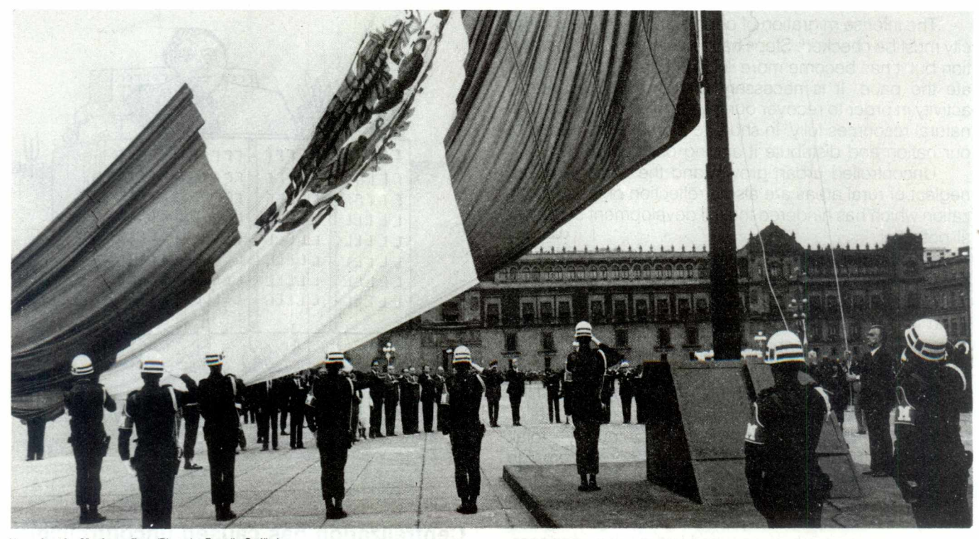
Honoring the Mexican flag.