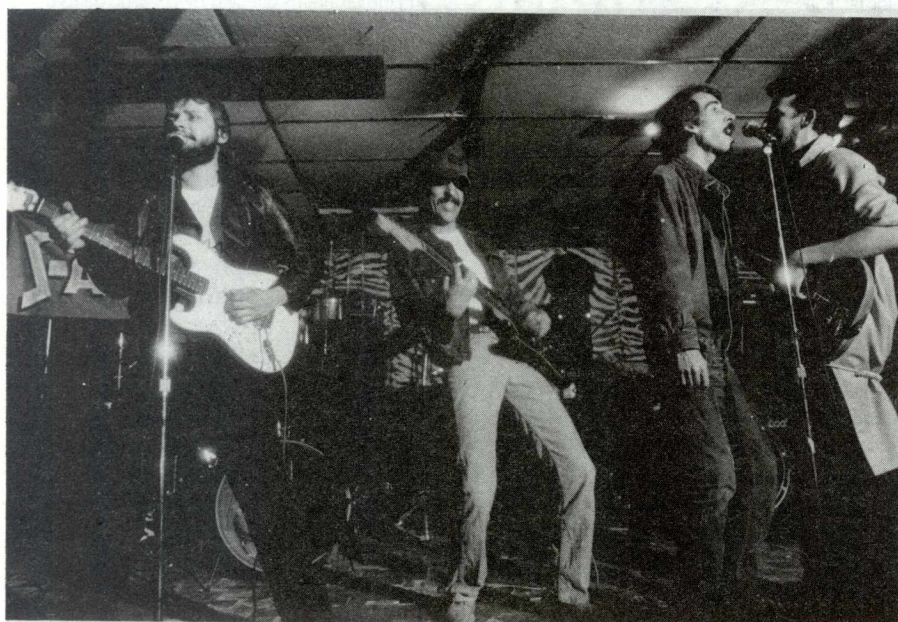
Mamá-Z in concert.

This process has just begun. How long will this last? For the moment, and despite the palpable enthusiasm of the musicians and producers alike, no one knows for sure. Television in Mexico can at any moment silence any musical initiative which differs from the one it has established.