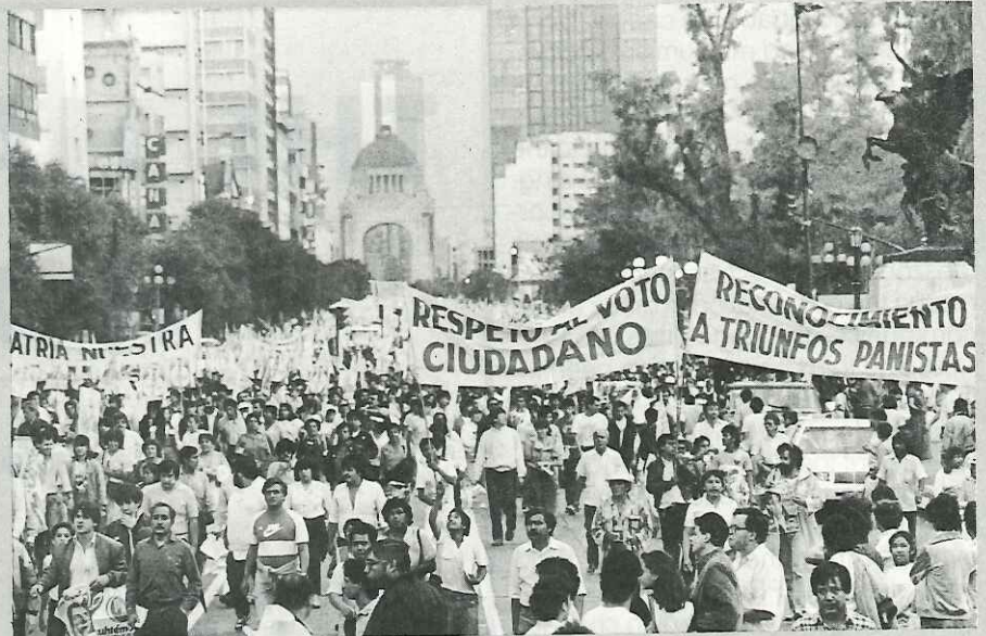
March for respect for voting.

If the electoral map is examined, it may be clearly noted that tendencies vary notably between different regions and even within each region. The center is not the same as the southeast