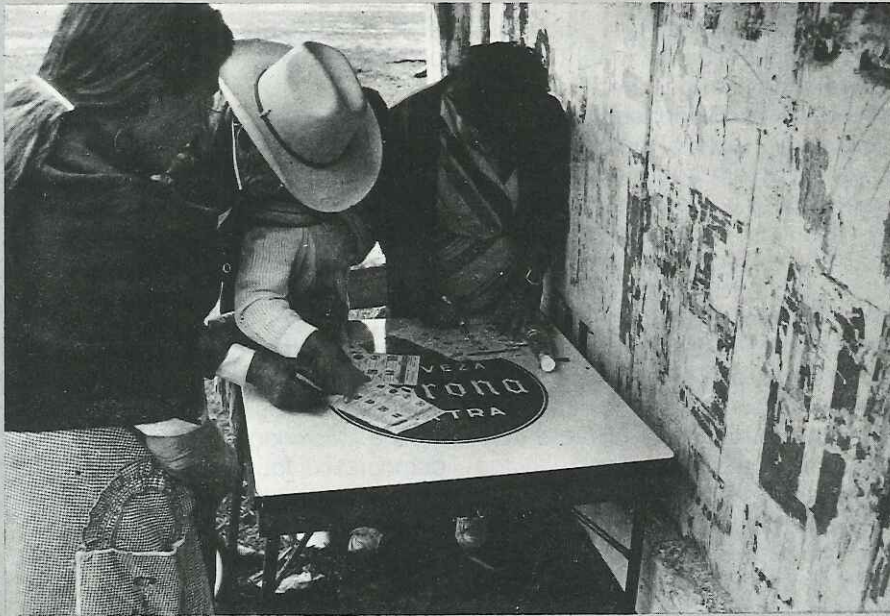
Election day in the countryside.

also confronting the dilemma of transforming or weakening themselves and the logical path that lies ahead is a reorganization of intermediary forces, based on the double support of internal democracy and of the negotiatory capacity of its leadership. We cannot ignore the importance of the relative independence that characterizes the sectors. Each one represents a segment of the national reality. To ask them only for discipline is to lead them to their own defeat. They exist in order to defend their constituents' interests and this should be seized with greater combativeness. Internal democracy should not be incompatible with class leadership. Of course vices such as imposition which have damaged our great organizations have to be rejected. But the party's different sectors—fundamental columns of our party—must strengthen themselves in order to survive.