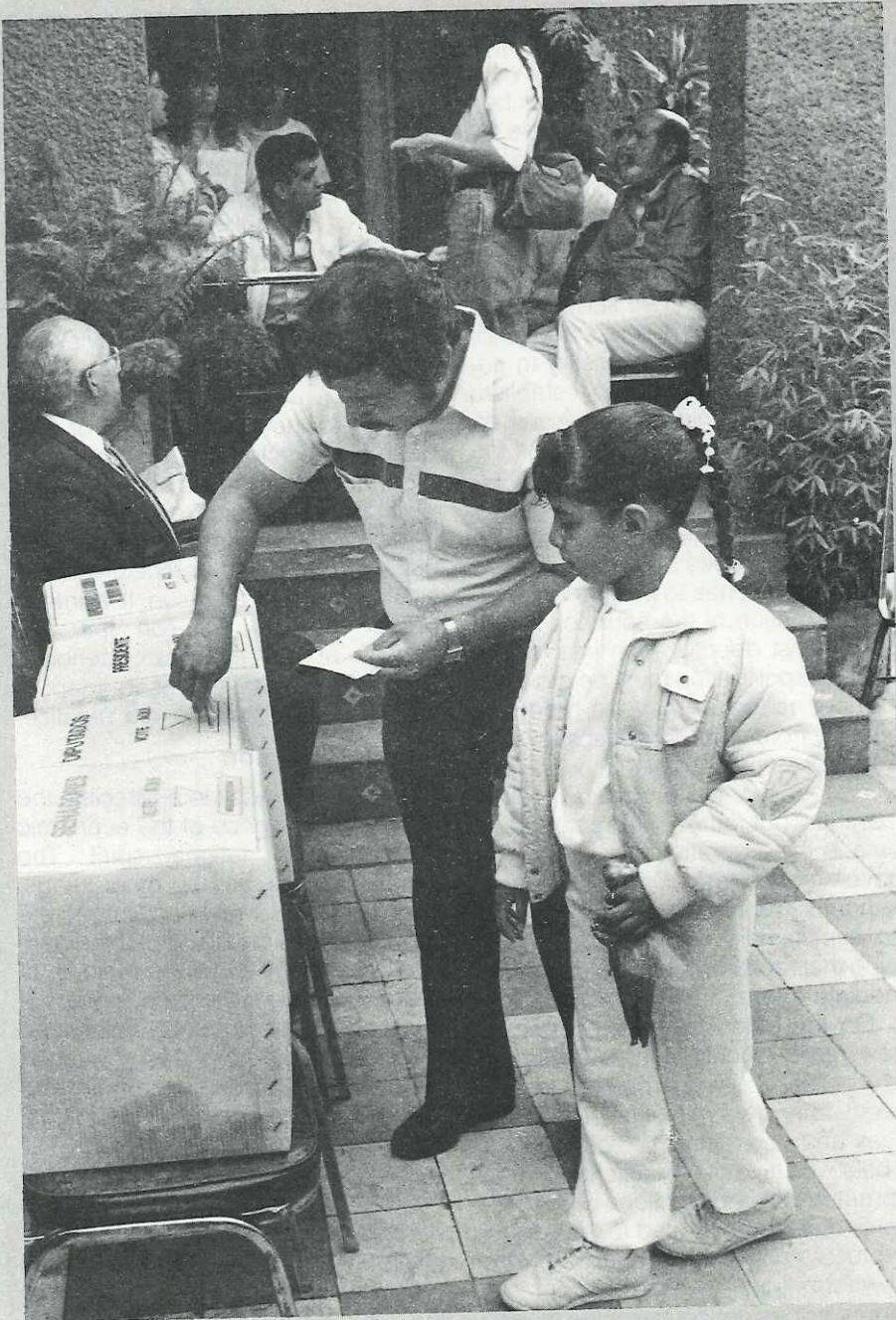
Citizen participation.

The PRI will have to run the risk of abandoning many of its traditions and forms, to concretize its own platform as a political party, even above the particular interests of the sectors that constitute it. It will be necessary to work with them. The reason is clear. As I said before the elections, we change or things will get worse. Why? Because with real options to the left and to the right, voters who do not see their expectations for change satisfied will be able to vote in the next elections for the extremes and this would mean a split in the party that has promoted the advance of Mexico's modern history.