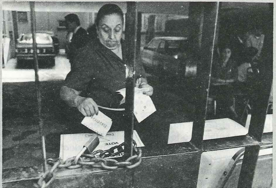
Election day at the polls.

It is necessary to pause and reflect seriously on Mexico's possible future, to first review in our imagination the paths that must be traversed to perfect our political system without breaking with the best of the past. It is clear that since July 6, a transition toward full Mexican democracy has begun. What