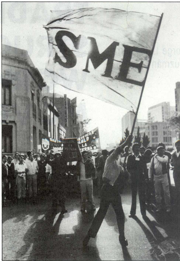
The strike by the Mexican Electricians' Union was declared non-existent in 1987.

The statements made by the Director of the UNAM Law School take on special importance at this moment, when modifications to the Federal Labor Law are about to be debated in the Congress, which is to decide, from the legal point of view, the future of relations between workers and their employers.