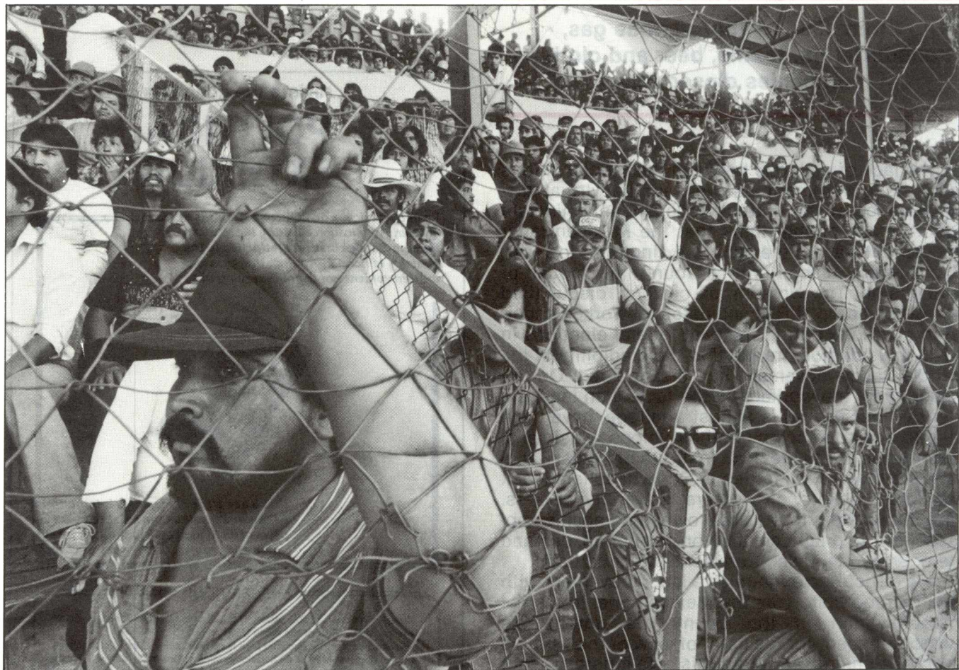
Striking workers of Altos Hornos in Monclova, Coahuila, in a general assembly, April, 1989.

Independent unionism, impelled by the still recent 1968 student movement, had a great apogee during the 1970's. Its proposals for union democracy, defense of workers' living conditions and for national sovereignty and economic independ-