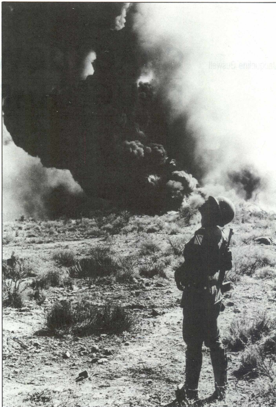
The Mexican Army participates in the government's efforts to eradicate drug production and trafficking.

During the De la Madrid government, from December 1, 1982 to November 30, 1988, the authori-