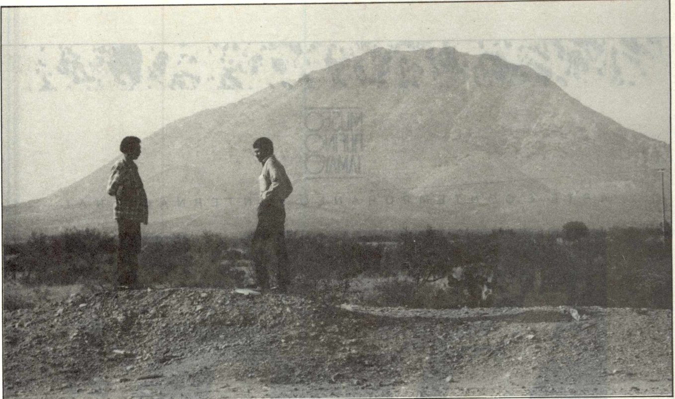
"Will we make it?"