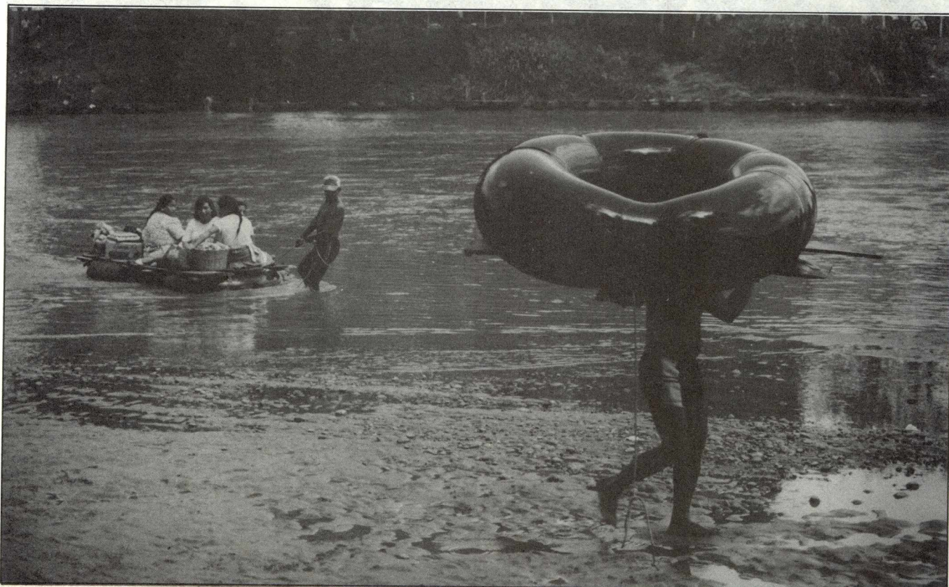
The first river crossing: the Suchiate.

A life in peace and justice is often a mirage for those Central Americans who travel without passports and visas through Mexico to the United States. They face multiple obstacles between the Suchiate River (the Guatemalan-Mexican border) and the Río Grande: they are not given refugee status, they are extorted by Mexican police, and they are deported to their countries of origin in spite of the violence there. If and when they finally reach the United States, they frequently encounter persecution, discrimination and other abuses. Antonio Turok, photographer for Imagenlatina , accompanied the odyssey of a group of Central American migrants through Mexico. These are some of the images he captured.