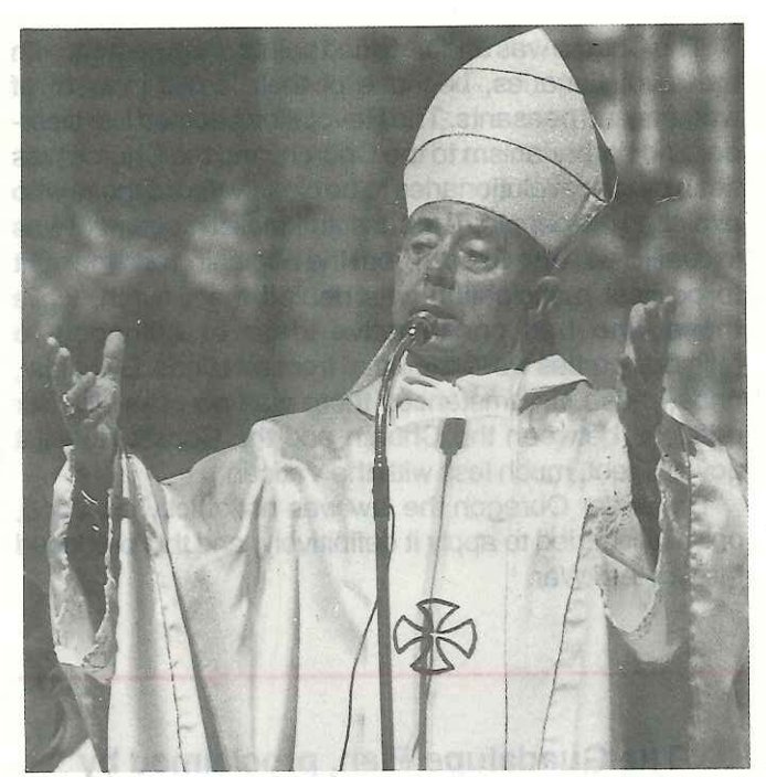
Archbishop of Mexico City, Ernesto Corripio Ahumada demands greater political space.