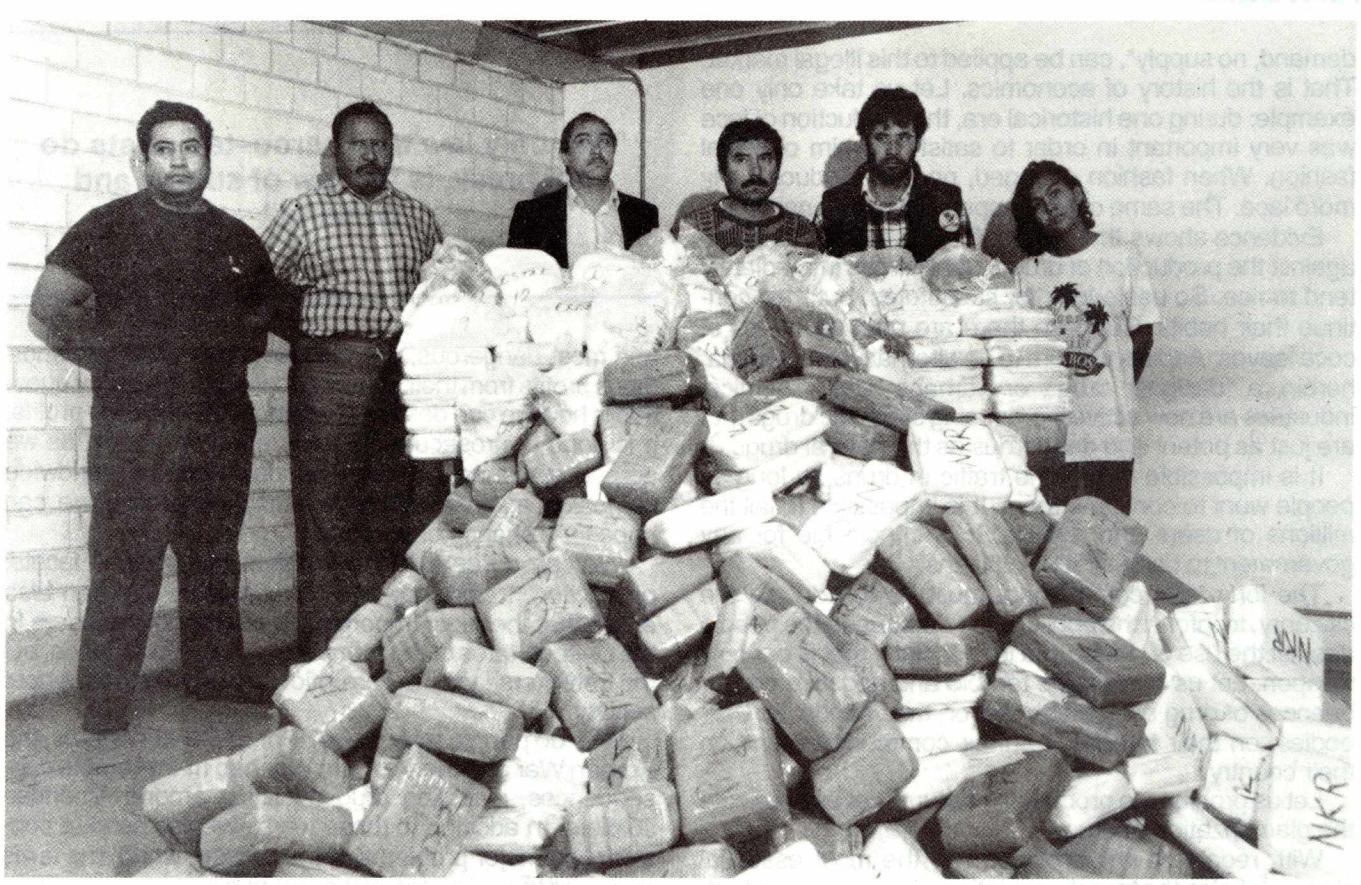
Tons of cocaine captured by Mexican authorities.