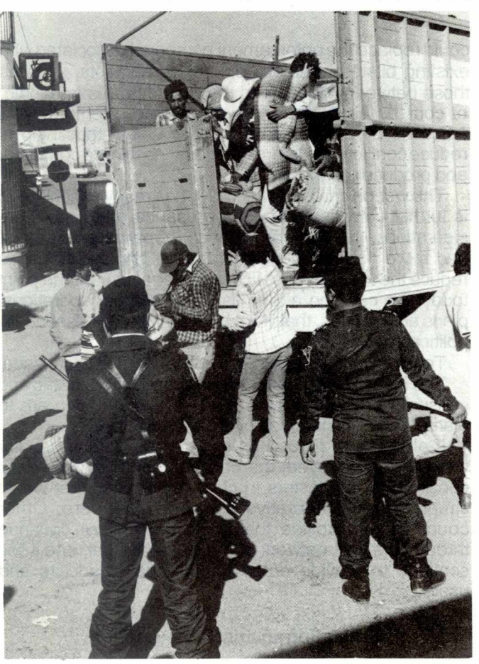
The Mexican Army collaborates in the anti-narcotics campaign.

With regard to law enforcement, the most essential step is defining the target population. The most important,