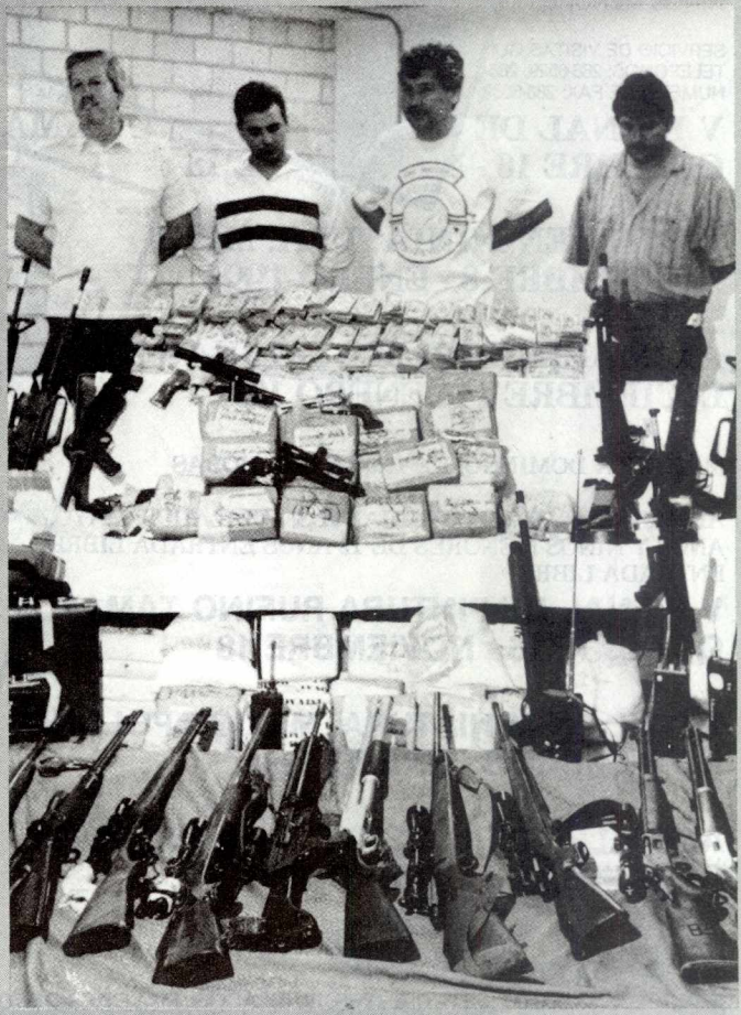
Drug dealers are usually heavily armed.

This assessment came out to be partly true, since during the investigation of the case it was found that many