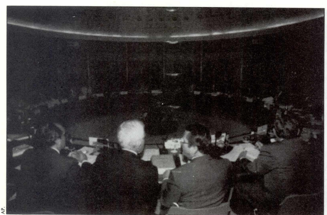
A day before the presidents began the Ibero-American Summit, their foreign ministers discussed the details of agreements.

their inhabitants, and to the human rights and fundamental liberties "that are the pillars of our community."