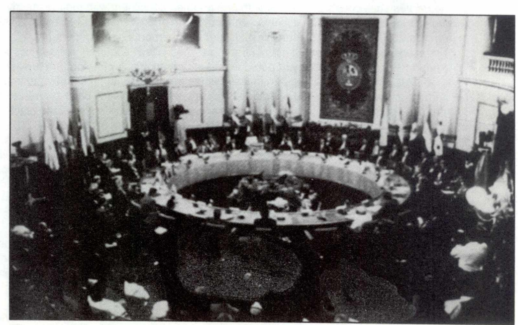
The meeting's final document insists on the need for absolute respect for a state's sovereignty over its territory.