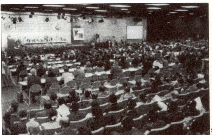
A record number of world leaders participated in the two-day Summit.

Paradoxically Brazil's total 1992 budget for environmental affairs was 60 million dollars, and environmental