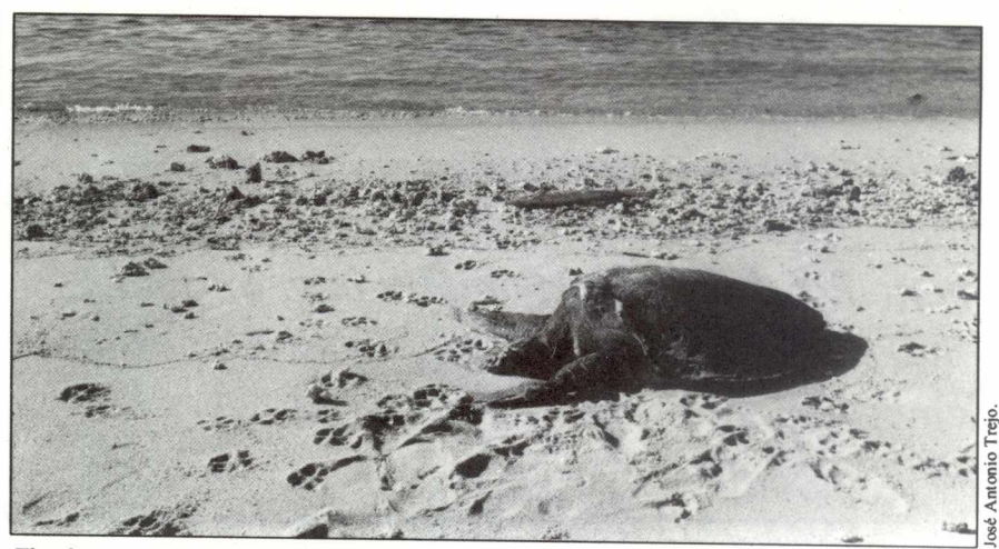
The destruction of the environment has worldwide effects.

3. A declaration of basic global principles on environment and development called The Earth Letter