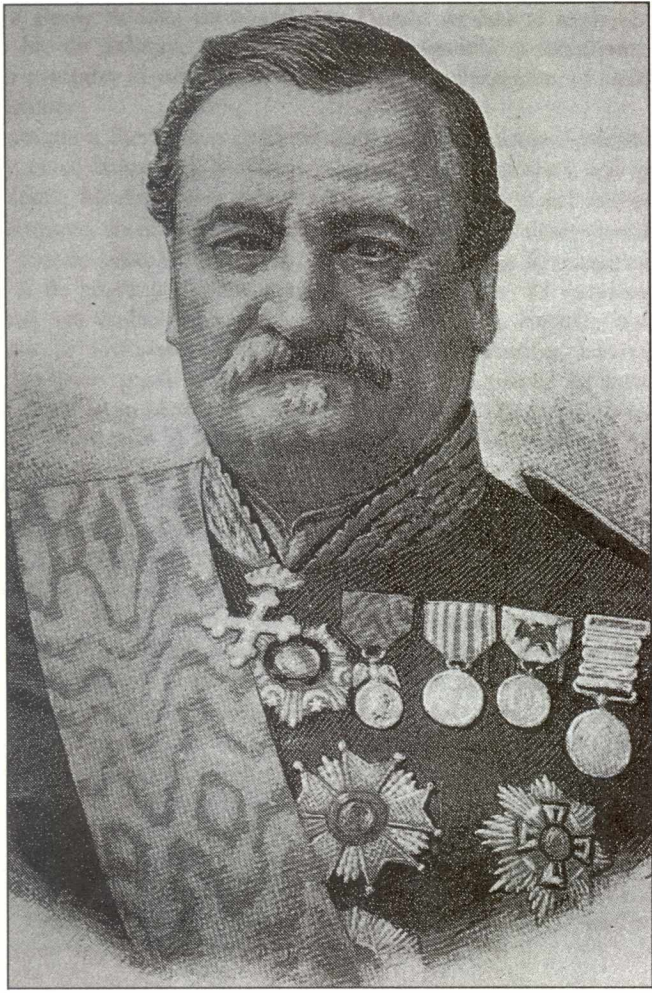
General Elie Frédéric Forey.

The few who had settled in the area around Córdoba were not disturbed, and continued to live there, but most went back to the United States. Undeterred, Shelby tried to set up another colony, this time near the banks of the Tuxpan River, confident that its distance from trouble spots and the lack of communications would allow him to live in peace.