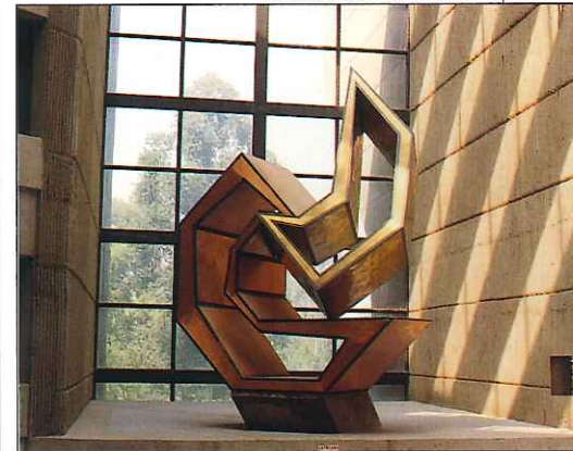
Hersua, The union of the human sciences (National Library).

garden, are located nearby, and there is a large, bright-red vertical metal sculpture in the center of this garden. The complex is dominated by the work of Sebastián, serving as a symbol of the area.