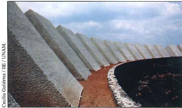
Cecilia Gutiérrez / IIE / UNAM.