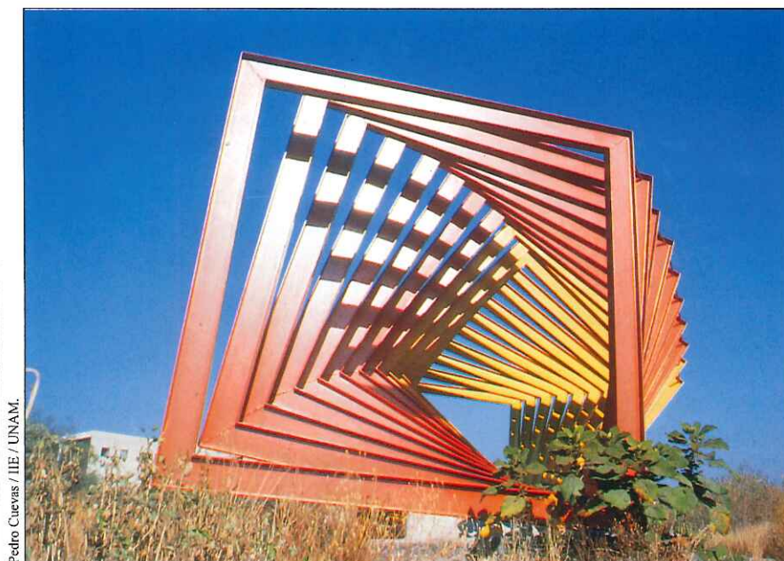
Pedro Cuevas / IIE / UNAM.

Only the most important works have been mentioned here, although others also make up part of the university's cultural legacy—a legacy that will surely be enriched in the future by the work of other Mexican artists ✕