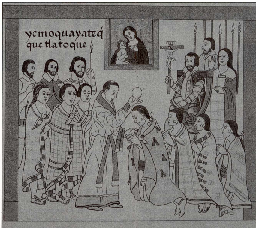
War was considered justified if it was fought to spread the faith.

But it is to the 16th century that we must trace the beginnings of this so-called right to intervene for humanitarian reasons. Faced with a large population of Indians, the Spanish Crown struggled to find a justification for its invasion and conquest of America.