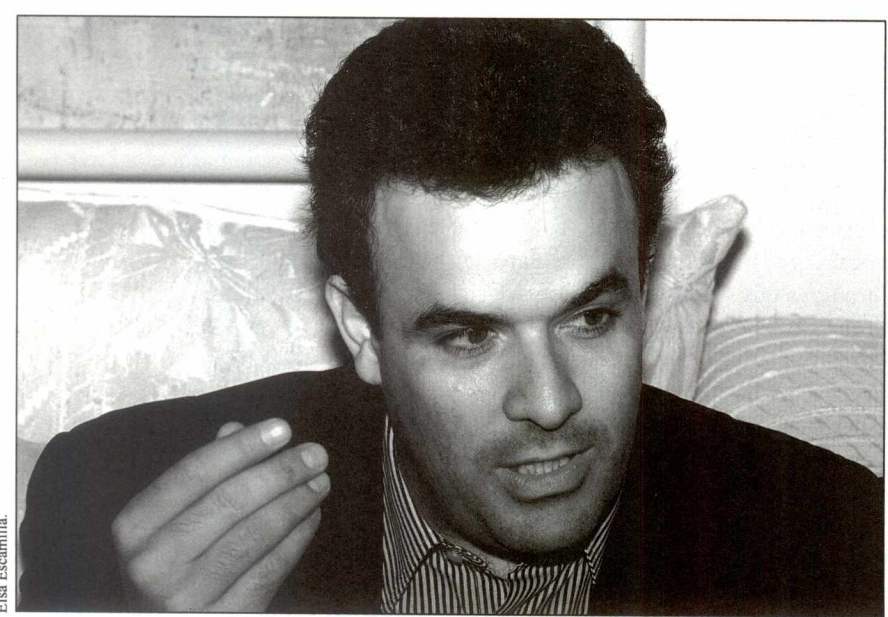
"Singing also means using your brain constantly."

much. In other words, I sang with a soft voice, supposedly so I wouldn't get tired. Now it's the other way around: the more I sing, the healthier my voice is. It's like everything in life: the more you use something in an appropriate way, the better it functions.