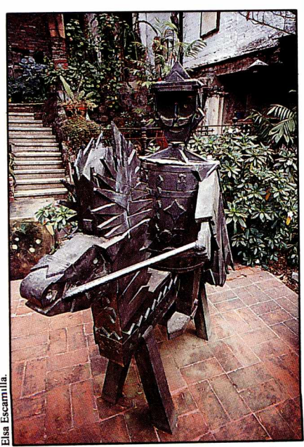
He built the house he shares with his three adopted children.

We chatted in front of the fireplace where logs crackle —although the fire was unable to overcome the invasive cold of the living room. Surrounded by magiscopios ("magicscopes") of