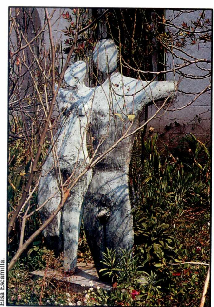
He uses the most varied materials to express himself.

I'm very distant, a bit on purpose, from the artistic movement, because it's so frustrating to see the envy and the intrigues, and I don't have time to waste out of the few years I have left in my life. I think when you analyze things, there must be a great number of artists today with a lot of talent who are completely ignored and forgotten. It's because for some reason Mexican politicians have frequently used the intellectuals. Politicians who have no culture whatsoever, at the moment