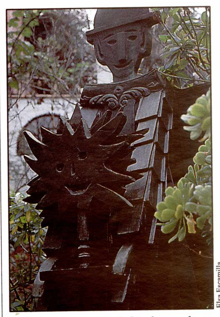
An Indian woman taught him love and respect for materials.

A telephone call interrupts the conversation and he turns away.