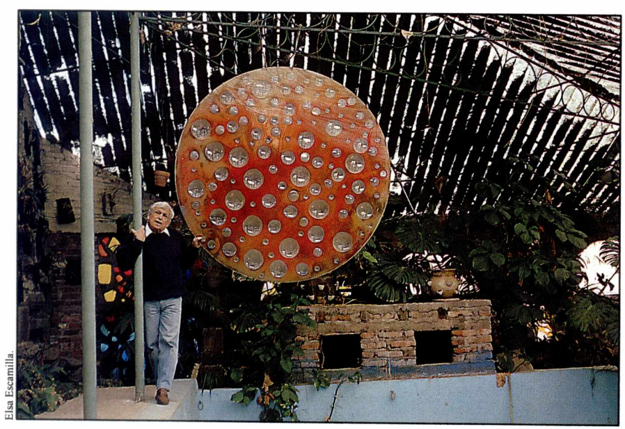
The pool welcomes visitors with scents of fragant wood.

—I believe there is an error in the present definition of what an artist is. Long ago, during the Renaissance for example, the concept of an artist was different. Michelangelo was a man who cultivated sculpture, painting, architecture and also poetry. To me, what is most interesting in life is to experiment. My work is constantly changing and, despite my age, I believe the changes will continue. I'm currently working on sculptures which resemble sea shells or which are based on the erosions of the earth. There is a paradox here: the erosions of the earth are very beautiful and at the same time very destructive. It is very pleasant to see or photograph them.