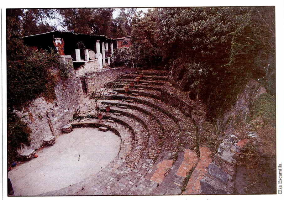
His open-air theater resembles a Roman forum left to the whims of nature.

provided me with a very large foreign audience. I also believe that whatever I do may or may not be well-received. but it is different from what other artists produce. One of the biggest examples of what the art mafias represent are the awards given by the National System of Creators. It seems like an insult to me, because the majority of those favored are not young. Besides their age, they have greater economic possibilities and they should not be granted life-long economic support. It also appears to me that there is a lack of dignity in some artists' acceptance of these awards. For me the concept of scholarships involves young people, without economic resources. There is an interesting point I would like to make: among the few young people who have received this or that scholarship from the National Council for Culture and the Arts, there are children from very wealthy families who don't need monetary help to carry out their work. Something else: very few of the students awarded scholarships come from the provinces, and very few are women. This is clearly scandalous. This scandal continues, and hopefully the time will