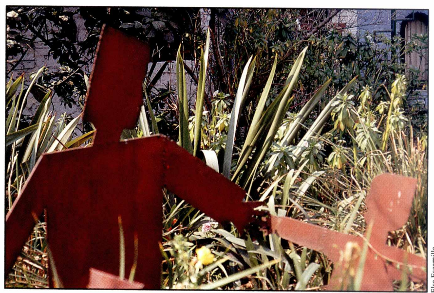
Some of his works emerge from amongst the plants.

-For some reason, in recent years I haven't been invited to participate in anything. I'm referring to the Fine Arts and Modern Art Museums, among other institutions. But I believe what has helped most in my career was precisely living for years outside my country, which