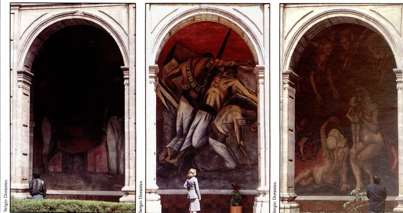
The Trench (triptych).

although they do not thereby lose their nature as parody. From left to right, the order of the murals is: Law and Justice , Jehovah Between the Rich and the Poor , Liberty , The Watchtowers , Trash and The Rich .