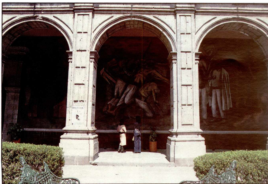
Orozco contributed the largest number of works on San Ildefonso's walls.

The most famous is undoubtedly The Trench , a magnificent fresco in which three men in peasant dress tense their marvelous bodies, without there seeming to be any specific intention to their movements. Framed by a geometric structure, they are