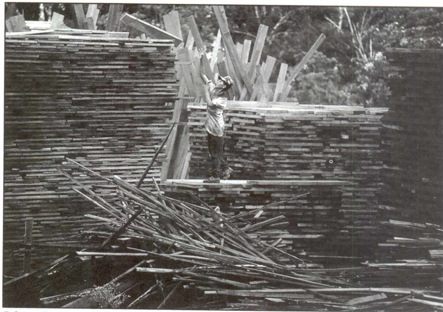
Piling up mahogany boards.

partnerships, "is the lack of a market for the great variety of wood."