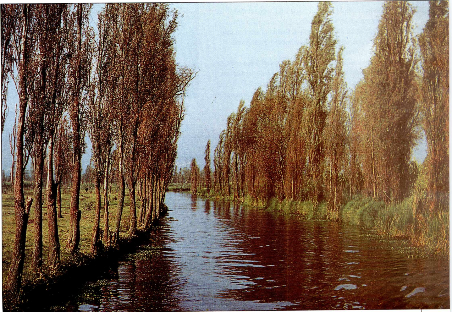
Beautiful view of one of the canals, bordered by ahuejotes, a common Xochimilco tree.