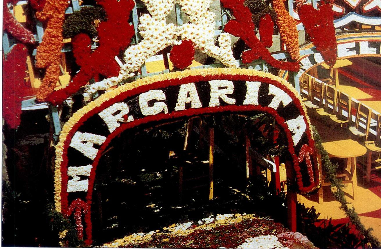
Typical flat-bottomed boat, when they still were decorated with flowers, used to carry visitors.

keep residual water from mixing with fresh. The used water is treated at an experimental, third-stage treatment plant, then three new pumping stations send it back into the canals and springs. In addition, the capacity of the two existing treatment plants was enhanced by 560 gallons per second.