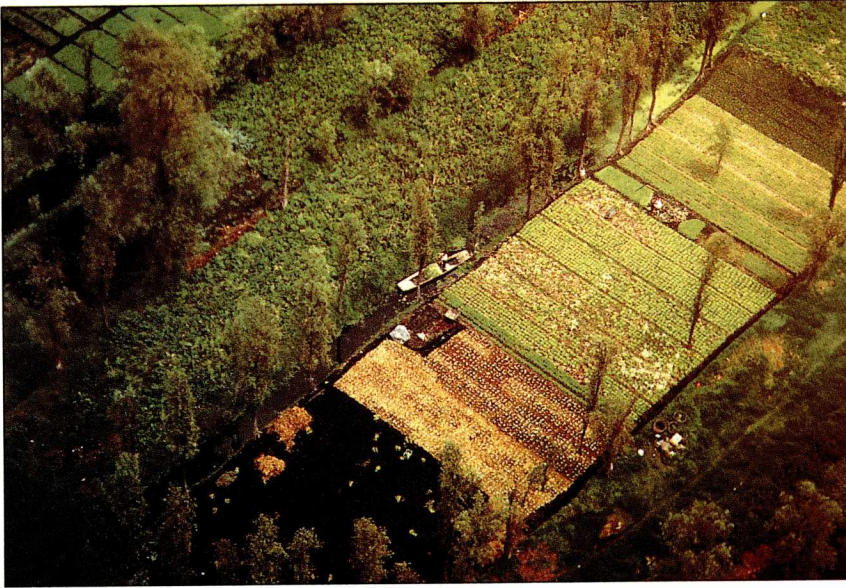
Flowers and vegetables are grown using the chinampa ("floating garden") system.

only three to four thousand people a week visited Xochimilco during the dark years of the late 1980s. Thanks to dark, polluted waters, terrible odors due to clogged drainage and encroaching urban development, Xochimilco's once-flourishing community was in danger of following the path to obsolescence of many preceding indigenous empires.