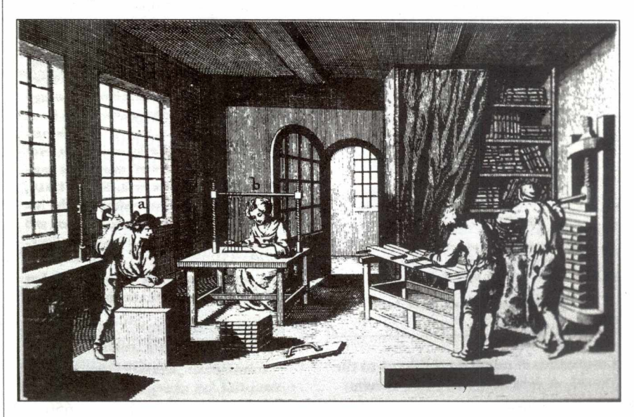
Books are the greatest inheritance of mankind.