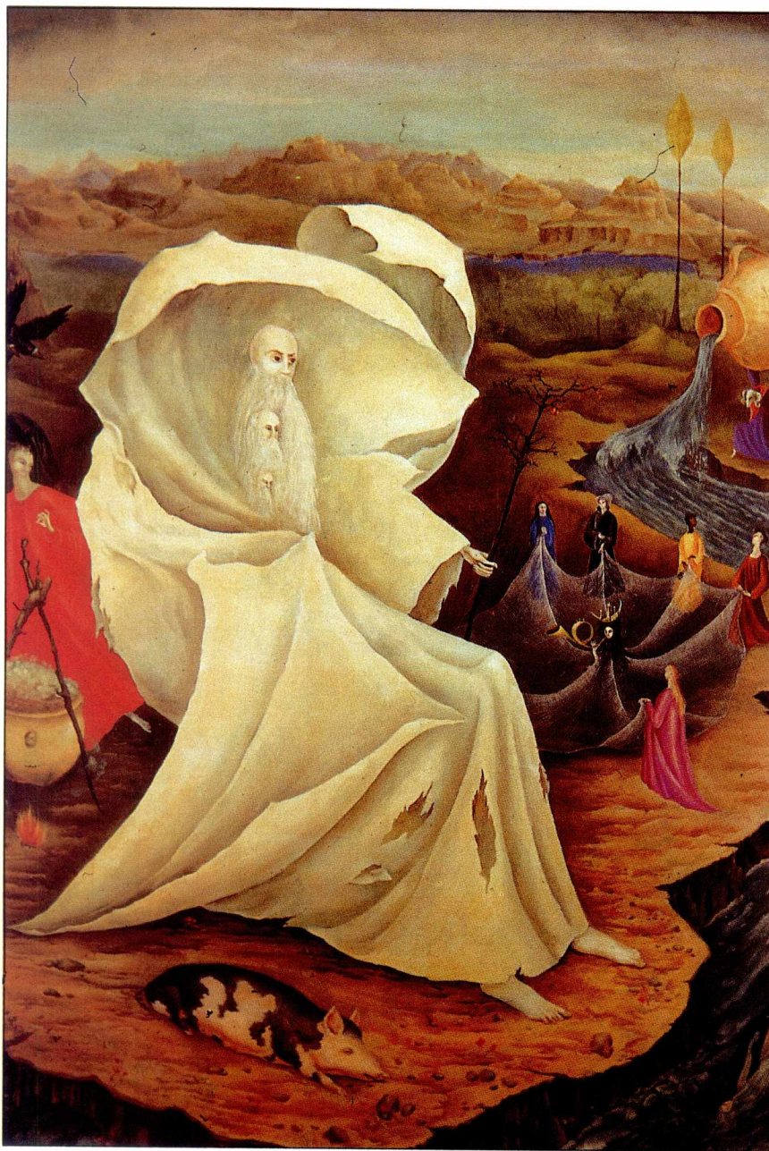
The Temptation of St. Anthony, oil on canvas, 1947.