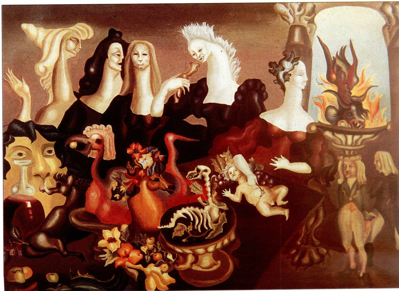
The Meal of Lord Candlestick, oil on canvas, 1938.