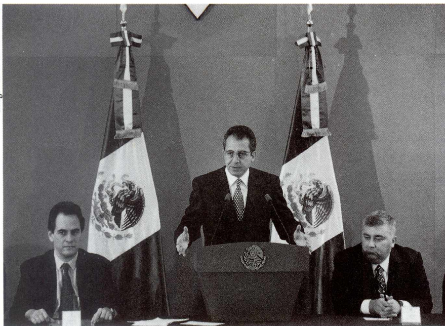
The government is promoting changes in both the political and economic arenas.

but others might not. Restraining the latter and preventing new violent episodes from exploding will be a critical political job. Finally, the third level of political reform has to do with the rule of law: developing a proper legal framework, enforcing the law, respecting the independence of the judiciary, developing strong property and individual rights and making it possible for due process to be permanently and systematically respected. In other words, extraordinarily ambitious objectives, multiple constituencies, agencies and contradictory interests and, altogether, enormous complexity.