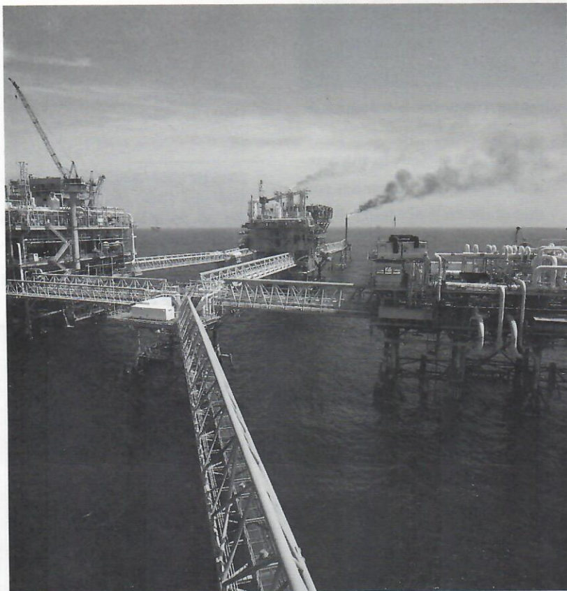
The area in dispute covers 58,940 square miles.