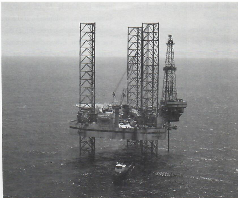
The Gulf of Mexico, one of the world's foremost petroleum regions.

From a diplomatic viewpoint, the drilling activities of the “Baha Project” appear to be the source of grave concern to the government of Mexico. 6 Two delicate technical questions appear to generate these concerns: first, the deposit Shell Oil Company is targeting in the Alaminos Canyon is just a few miles away from the maritime boundary agreed to by the United