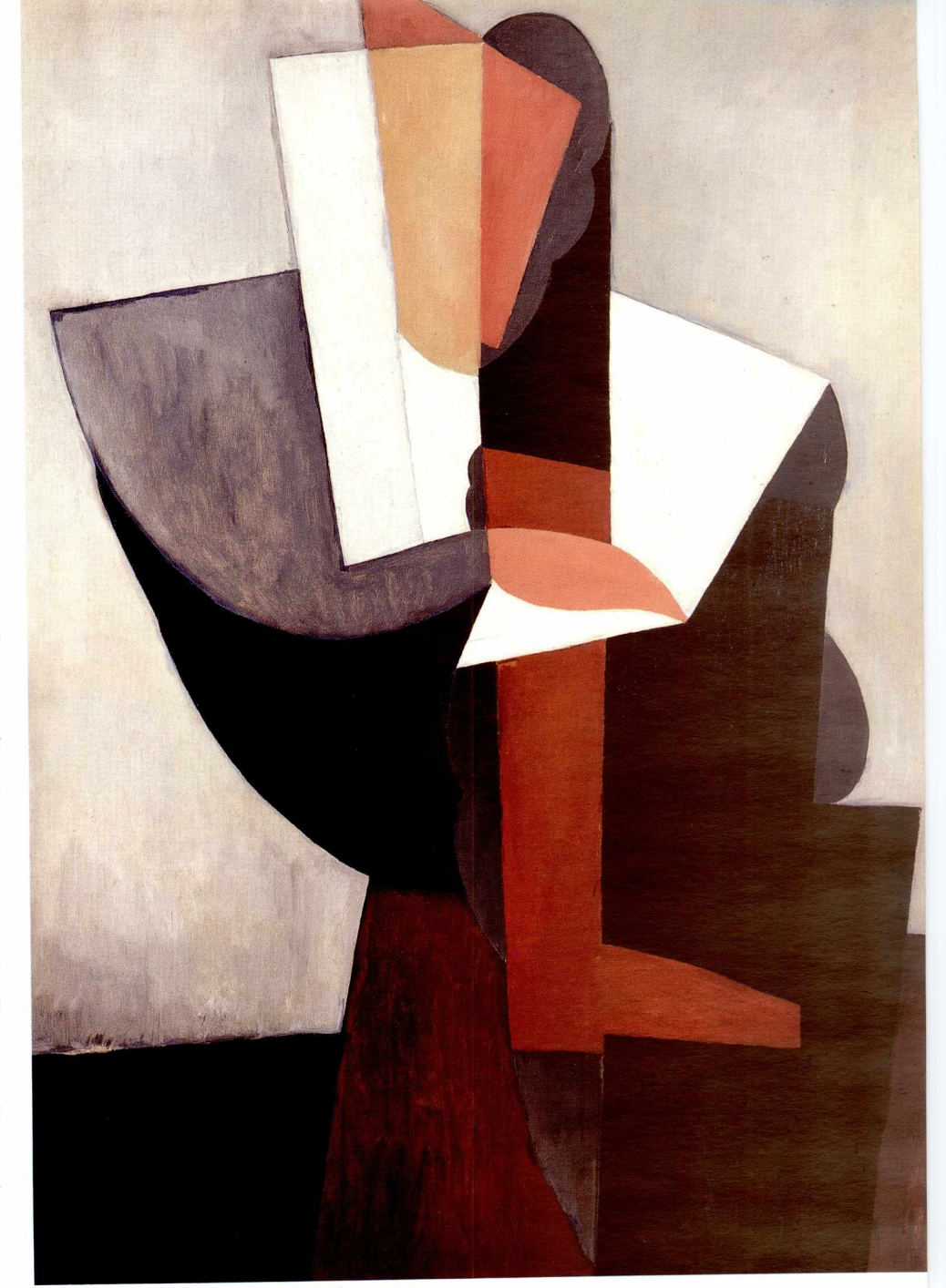
Portrait of a Poet, 1916 (oil on canvas).

There are similarities among Portrait of a Poet, Painter at Rest and Portrait of Maximilian Volonchine in the artist's intention of simplifying the expressions even more, as well as in his handling of large chromatic areas where there is a geometrical synthesis of the figures. Both the austere geometrical forms and the neutral backgrounds, which emphasize the characteristics of the figures represented, retreat from the use of vibrant colors and the richness of line that the artist had previously used. These paintings announce Rivera's evolution, interest and exploration between 1913 and 1917 when he made a notable incursion into one of painting's most important avant garde movements. Wi