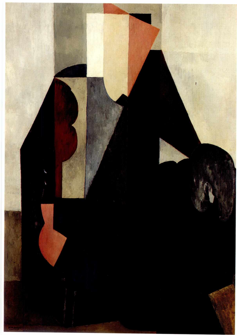
Painter at Rest, 1916 (oil on canvas).

Opposite Page: The Architect, 1916 (oil on canvas).