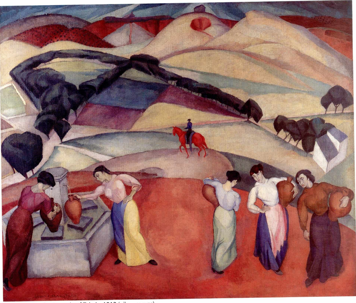
Diego Rivera, The Fountain of Toledo, 1913 (oil on canvas).

This select collection was lent for the 1958 opening of the Frida Kahlo Museum. Olmedo's original intention was to eventually donate it to the Diego Rivera Trust, which manages the museum. However, the donation was never made, thus allowing the collection to be exhibited around the world.<sup>2</sup>