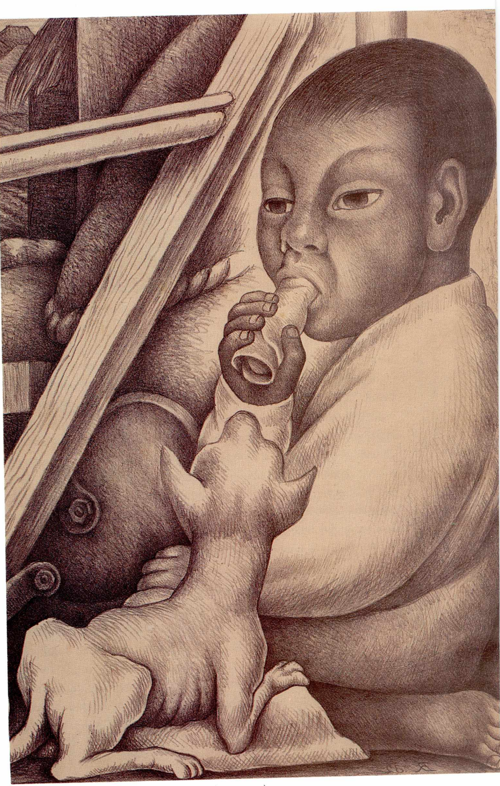
Diego Rivera, Boy with Taco, 1932 (lithograph on paper).