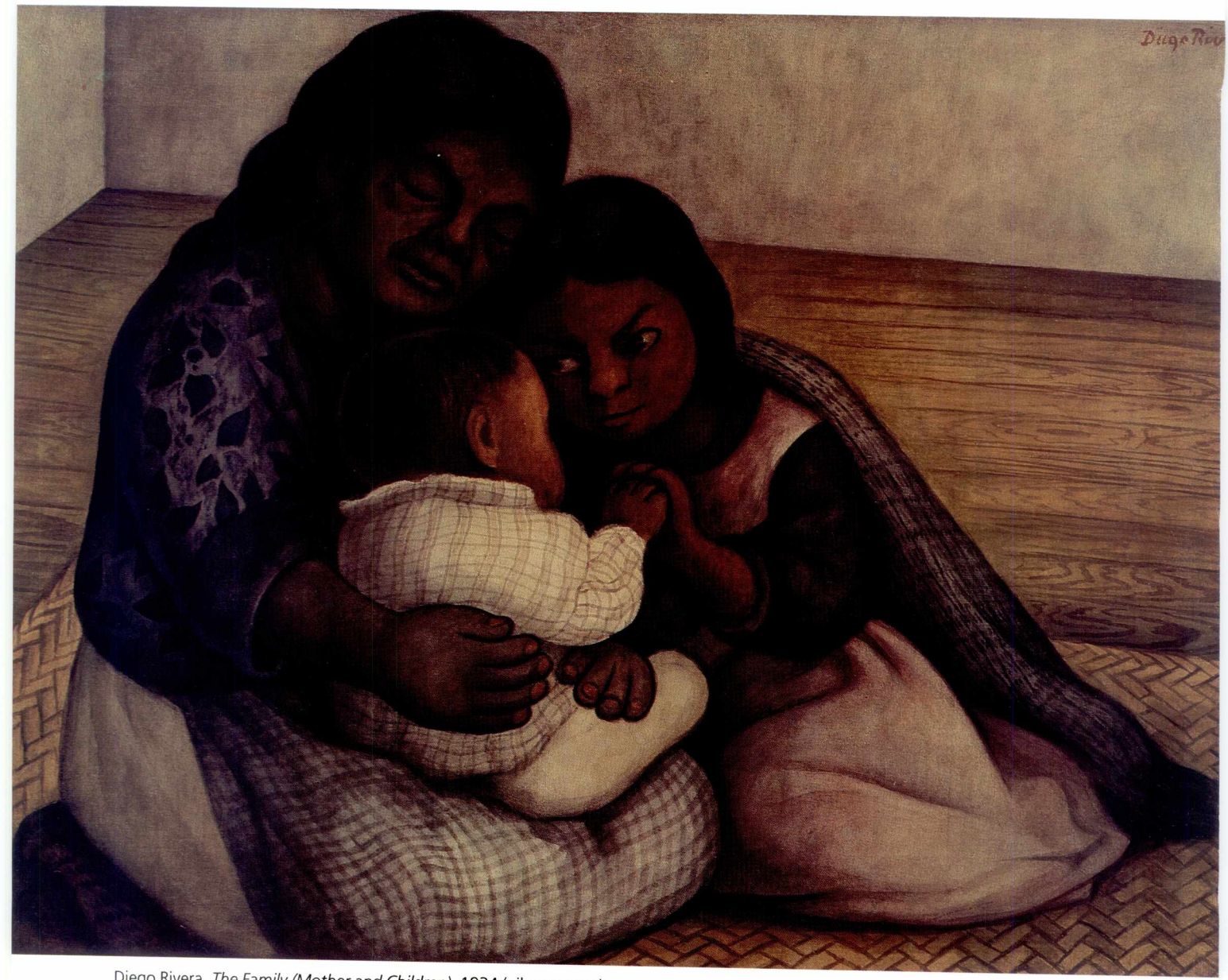
Diego Rivera, The Family (Mother and Children), 1934 (oil on canvas).

Olmedo says that Rivera did canvases to make up for what he considered a terrible business: painting murals.