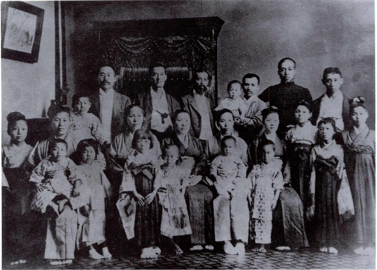
A Japanese immigrant family at the end of the nineteenth century.

solution for two basic problems: first, to finance domestic industrialization, for which it needed hard currency it hoped would be sent home by Japanese emigrants; second, to ameliorate demographic pressure in rural areas.