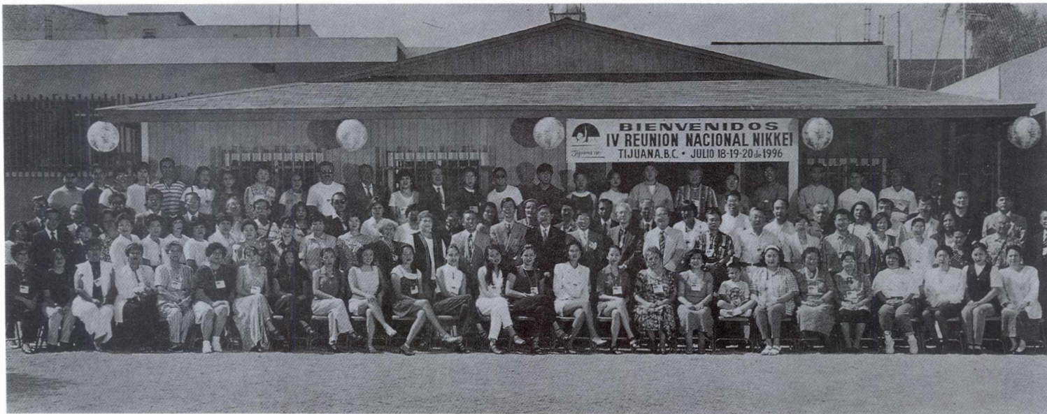
Japanese immigrants and their descendants in Tijuana, Baja California, 1996.