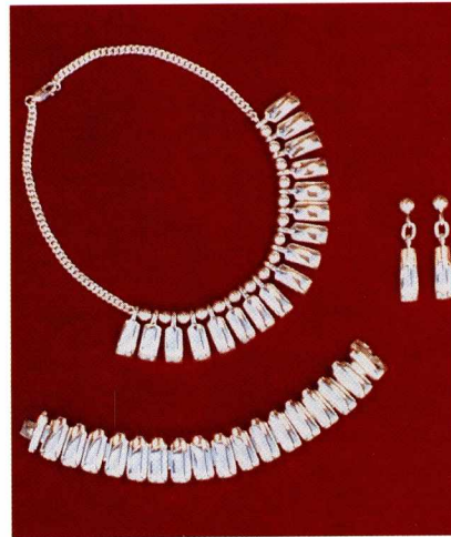
The Silver Center

Initially, the center accepted students completely tuition-free, provided them with their tools and made a gift of the tools at the end of the course. However,