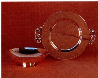
The Silver Center

Master craftsmanship is back in all its glory among the teachers, apprentices and students of the Silver Center of Zacatecas. Original, exclusive designs with local animal and plant motifs, as well as typical Zacatecas wrought-iron products and facades, are the trademarks of a school that is reviving the tradition of training first class craftsmen, specialists in jewelry making and silversmithing.