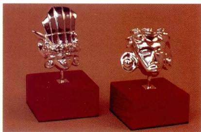
The Silver Center

A swift jump in the population, enormous riches and the establishment of important religious orders who did widespread missionary work and accumulated many books in their convent libraries, helped make the city—dubbed "The Civilizer of the North"—the second most important in New Spain. 1