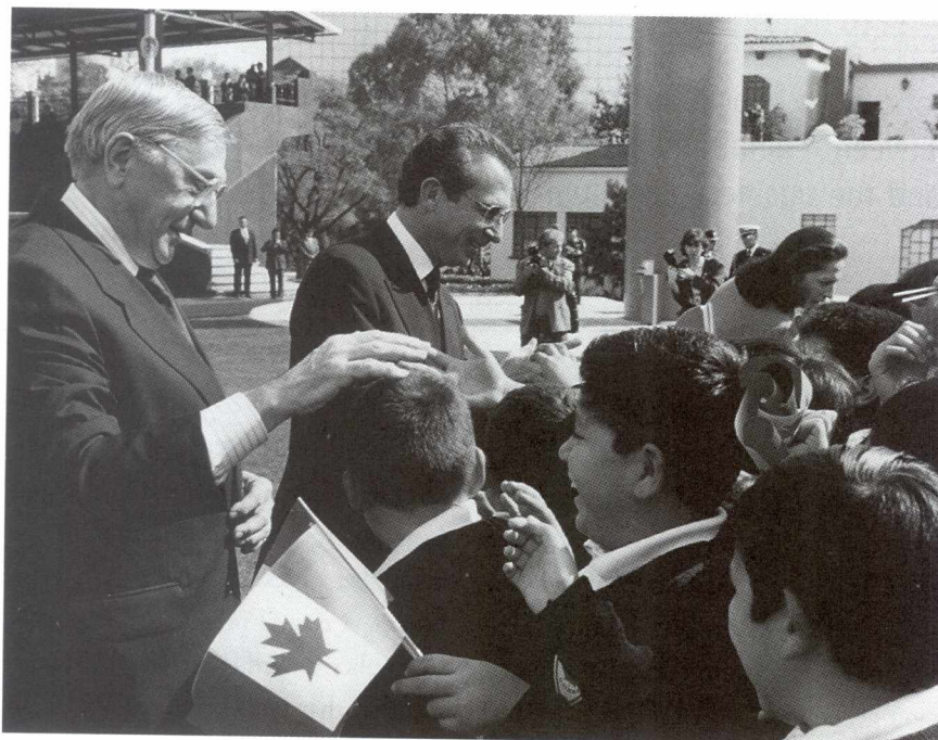
LeBlanc and Zedillo during a visit to a Mexican elementary school.

The visit shows the importance that both Mexico and Canada assign to mutual trade relations four years after the North American Trade Agreement (NAFTA) went into effect.