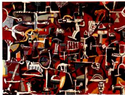
Up and Down , 140 x 180 cm, 1997 (oil on canvas).