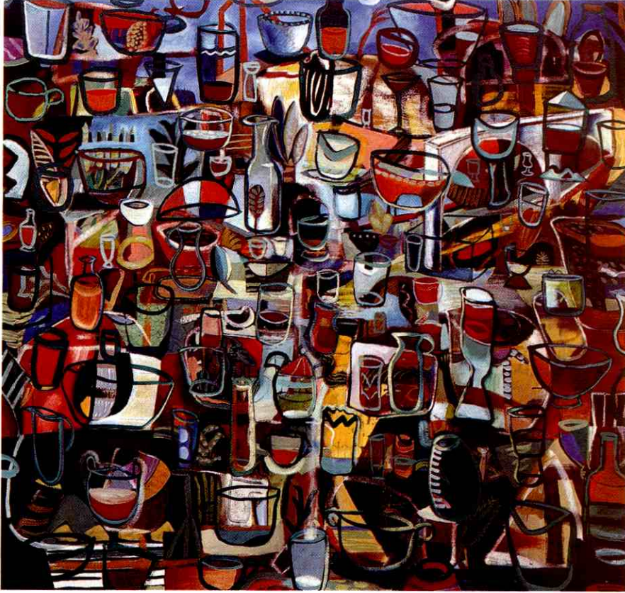
Containers , 140 x 150 cm, 1997 (oil on canvas).