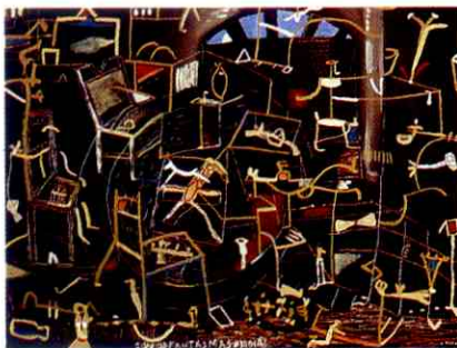
Ghosts , 60 x 80 cm, 1995-1999 (oil on canvas).