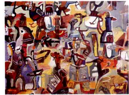
Sun and Shadow , 100 x 110 cm, 1998 (oil on canvas).