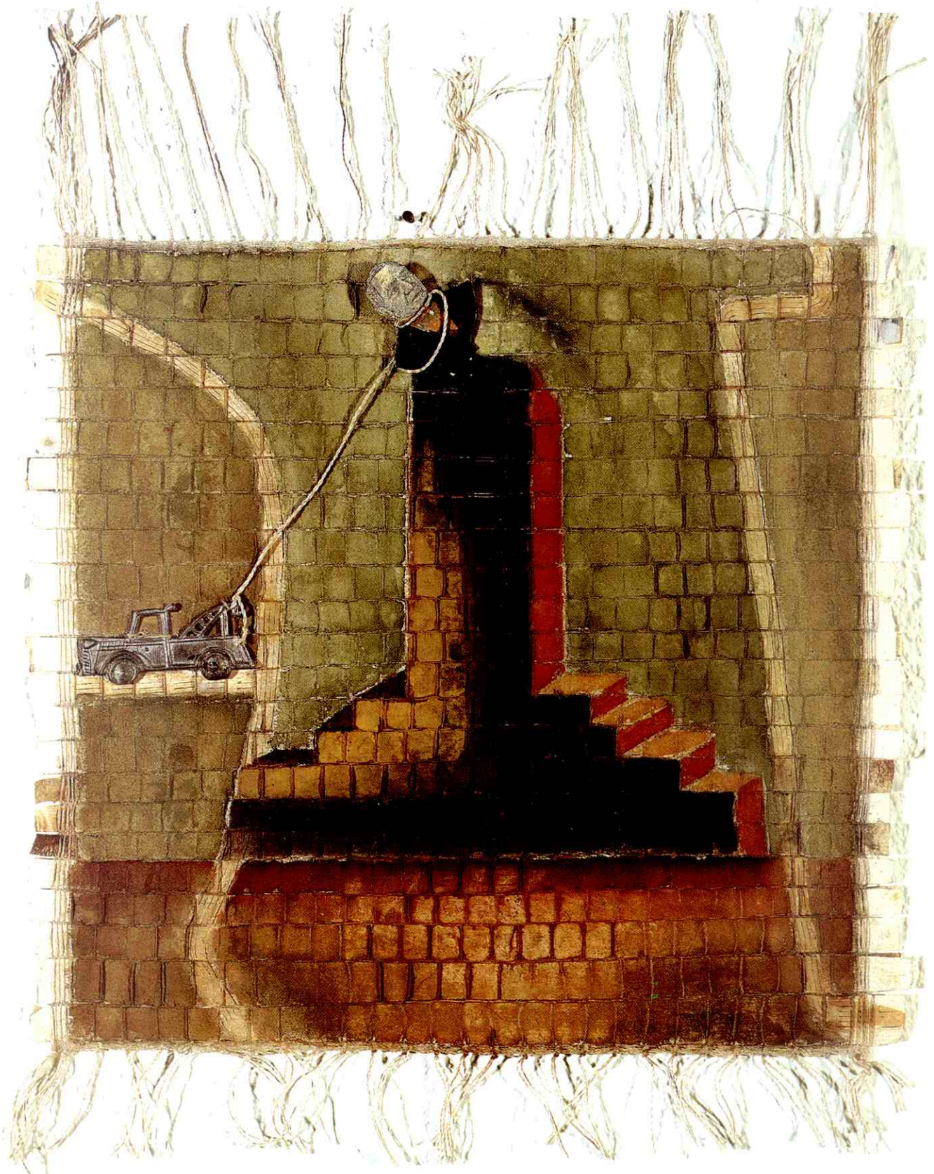
Reform Avenue , 50 x 40 cm, 1995 (mixed techniques, woven amate).