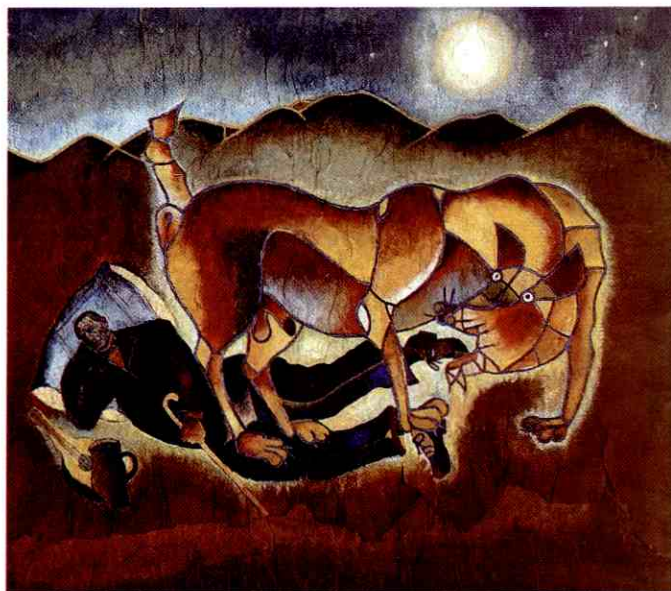
Juárez as a Sleeping Gypsy , 1986 (mixed techniques/paper).

tinize newly-wed women and women giving birth, reduce his size or become a giant at will, suffer reverential treatment from iguanas and crabs and turtles and deer, go through the looking-glass, allow himself to be followed by women-folk, as well as lead Nature to seduction or to agitation.