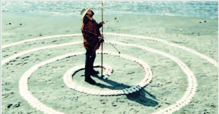
Under California: The Edge of Time shared Best Picture with Little Saints at the 1999 Los Angeles Latino Film Festival.

Ana (a character in the play and film Sex, Shame and Tears ) 8