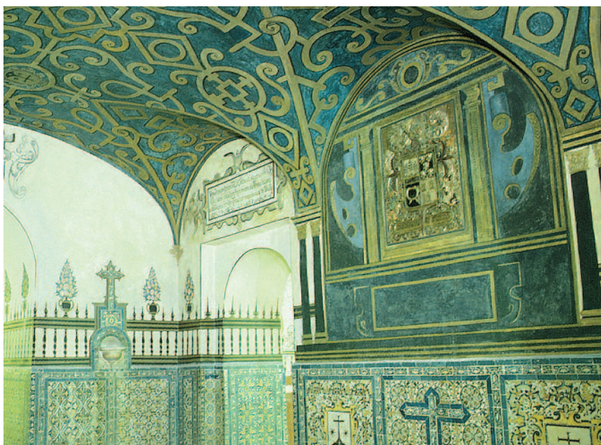
Among the museum's main attractions are the crypts.

most attractive parts of the museum: the crypts. The space itself is extraordinary, with an altar and majolica-ware covered wainscots, walls and vaults decorated with paintings, alabaster fonts and an altar with an oil painting attributed to Pedro de Campaña. 3 Our Lord of the Column with Saint Peter . Next door is