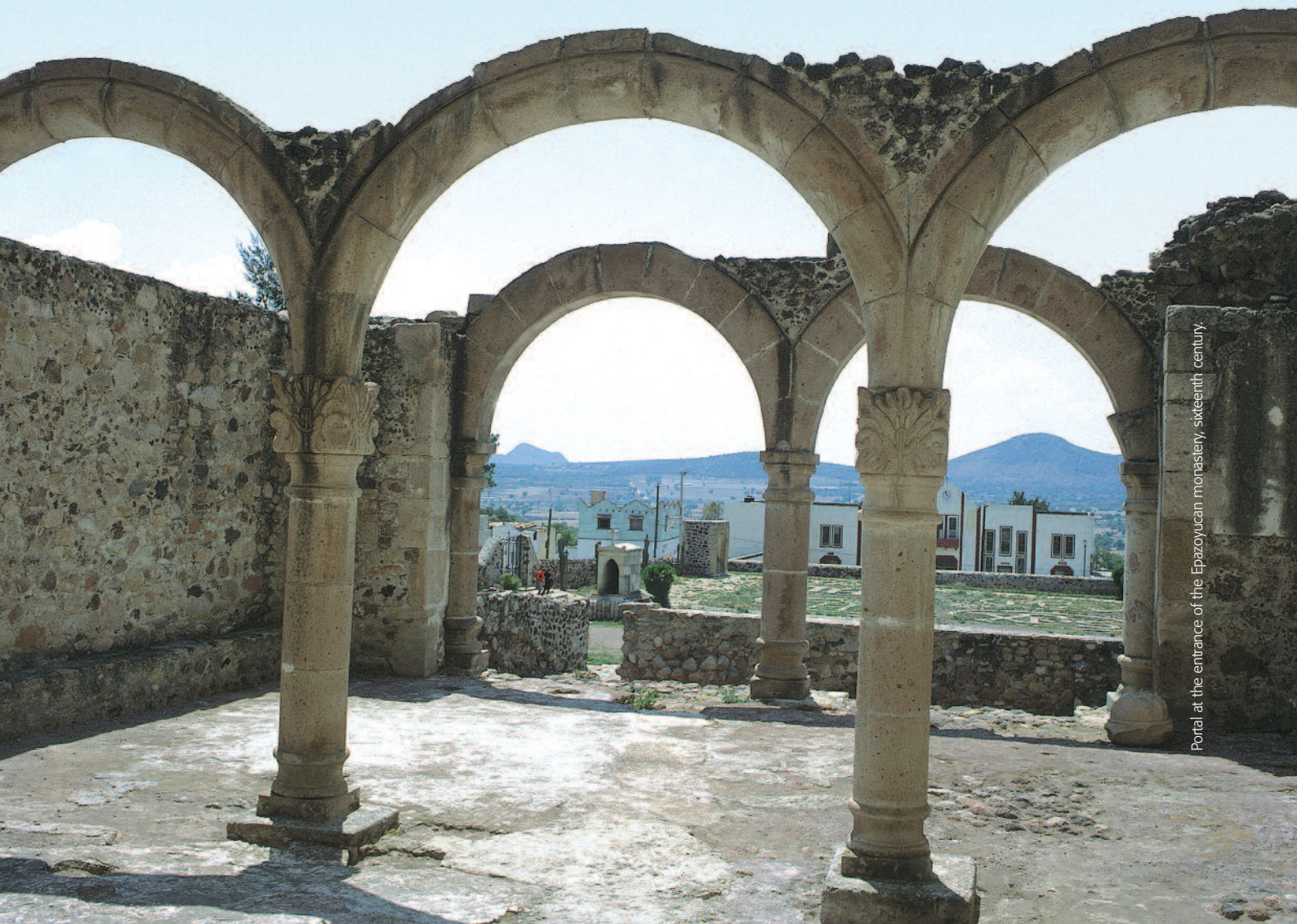
Portal at the entrance of the Epazoyucan monastery, sixteenth century.

Nevertheless, the conquistadors had the help of an important part of the Catholic Church, undoubtedly the most active, educated and enthusiastic clergy of its time. Hernán Cortés asked Carlos V to send Franciscan friars to preach Christianity in New Spain. The friars's rules of behavior were different from diocesan priests: their vows of