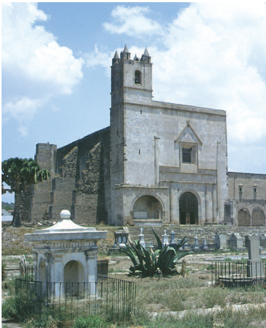
The Epazoyucan Monastery, founded in 1540 by the Augustinians.

These convents were not only religious centers. Along with Christianity, the friars transmitted cultural models, a new language and new customs; they adapted plants, taught skills, recovered the indigenous languages and history—even though in the end they imposed their own—and their presence determined the relocation of entire towns. In accordance with the precepts of their order, the Franciscans built simple, relatively unadorned monasteries, whose austerity transmits a feeling of serenity. An excellent example is the church of San Francisco de