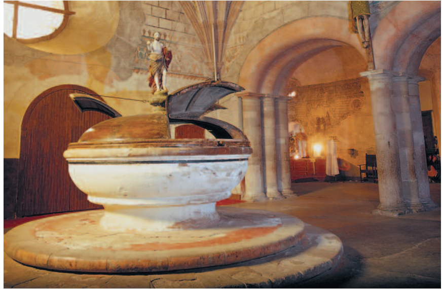
Actopan. This baptismal font is still in use.

The portico that led into the monastery crumbled and some of its arches were rebuilt only two decades ago. The cloister has more to offer the visitor in the way of art. Its two floors are held up by stone columns that support slender round arches. The mural of symmetrical designs with foliage, window lattices and arches motifs is worthy of note. At the ends of the corridors are paintings depicting the Passion of Christ, some very well done like The Road to Calvary , a reproduction of a fifteenth-century German engraving, copied later by a French artist and reproduced here by an anonymous painter. Other scenes include Calvary , The Descent from the Cross and the Ecce Homo or The Presentation of Jesus Scourged . Above the door leading to the stairway is The Assumption into Heaven of the Virgin Mary , the moment when she dies surrounded by the apostles,