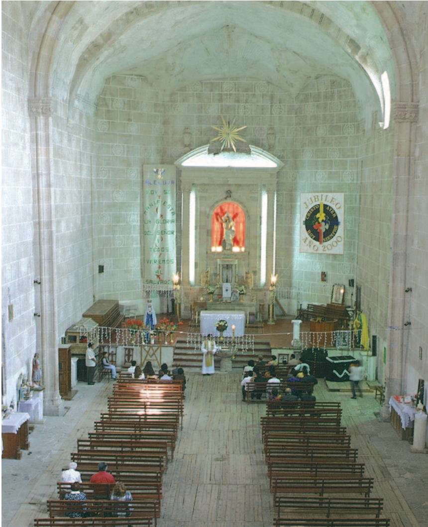
The Epazoyucan Church displays monograms with the abbreviation for Christ in Latin and Greek.