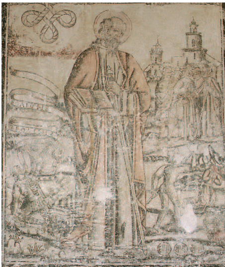
Saint Paul before his conversion to Christianity, an example of viceregal art in Tepeapulco.

The conquistadors had the help of the most active, educated and enthusiastic sector of the Catholic Church to reproduce their own culture in the vanquished lands.