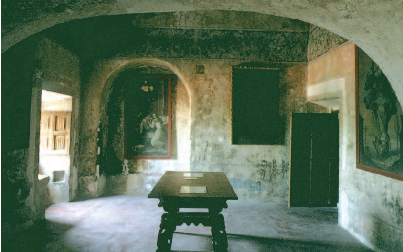
Actopan. The different sized cells are small museums in themselves, their walls covered with paintings depicting different moments of the viceregal period.