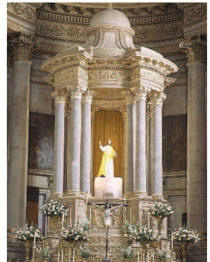
While the Franciscan friars' vows of poverty are reflected in their buildings, the Augustinian monasteries and churches are more ostentatious, as any visitor to Ixmiquilpan can attest to.

umns with shafts in the form of a spiral or tresse and a small arch decorated with rosettes.