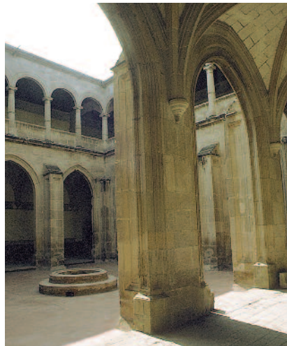
Actopan's impressive cloister. The high pink stone gothic arches on the ground floor contrast with the semi-circular Renaissance arches of the upper part.