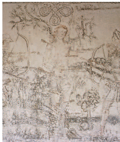
Sixteenth-century mural at the Tepeapulco Monastery depicting the martyrdom of Saint Sebastian.

The friars did not close themselves up in a monastery. They lived with, comforted and preached to the people at the same time transmitting a new cultural model and language.