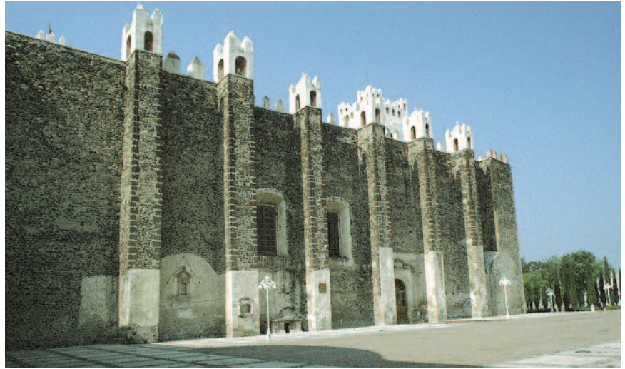
Actopan. Saint Nicholas of Tolentino Church and the monastery built by the Franciscans in 1550 merit more than one visit.

one of the great, handsome temples of the Devil was, a temple they then tore down; because, since the town is large and has many other subjects, it had great teocalli or temples to the Devil. 2