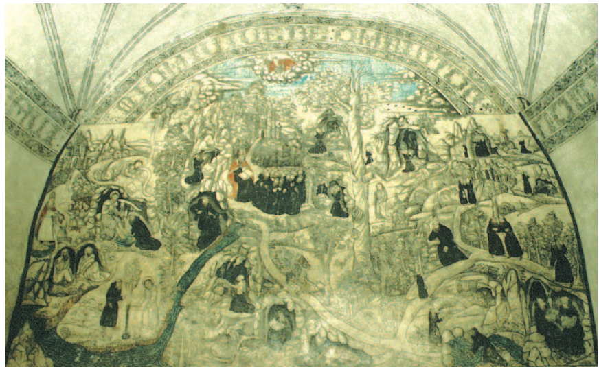
Actopan's entrance hall. A great mural depicts the legendary history of the founding of the order and the life of the Augustinians in New Spain.

with a contingent of angels at hand showing that her body will be borne to Heaven. Above that scene is another in which the Virgin is crowned queen of the heavens by the Trinity, as written in the Psalms. This is undoubtedly one of the best examples of mural painting from sixteenth-century New Spain.