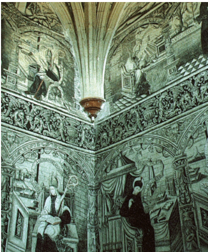
Actopan Monastery. The impressive main stairwell with sixteenth century paintings depicting the Augustinians' most outstanding figures from the Middle Ages until the time they were painted.