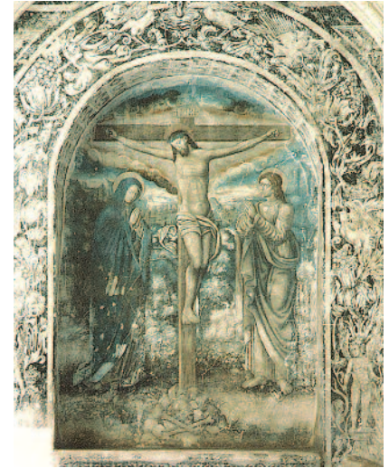
The omnipresent Christ the Redeemer, an icon for missionary work.