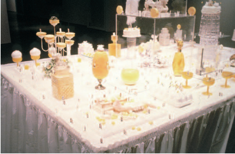
Franco Mondini Ruiz, High Yellow (detail), 243.8 x 182.9 x 274.3 cm, 1999 (colored water table).

multimedia works. The artists' wealth of ideas and attitudes is equally rich, from highly personal concerns to the exploration of the most relevant social and political topics, from powerful engagements of regional histories and memories to humorous and irreverent critiques of contemporary global culture. The exhibition's array of themes, diversity of interests and hybrid media reflect not only contemporary international artistic language but also the unique interweaving of cultures, races and voices that characterize the Americas today.