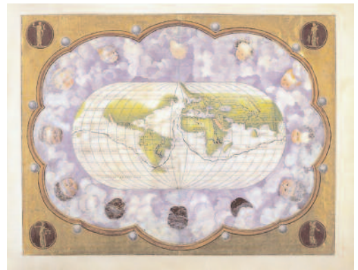
Battista Agnese, Mappamundi , 1544 (wash on vellum).