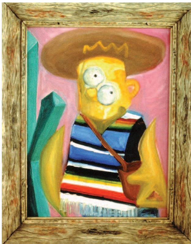
Rubén Ortiz Torres, Bart Sánchez , 50 x 40 x 5.5 cm, 1991 (oil on particle board).

San Diego's Museum of Contemporary Art is currently presenting the exhibition "UltraBaroque: Aspects of Post-Latin American Art," exploring the influence and impact of the baroque on a broad range of contemporary artistic expressions in the Americas. The exhibition, open from September 2000 to January 7, 2001, presents a critical reevaluation