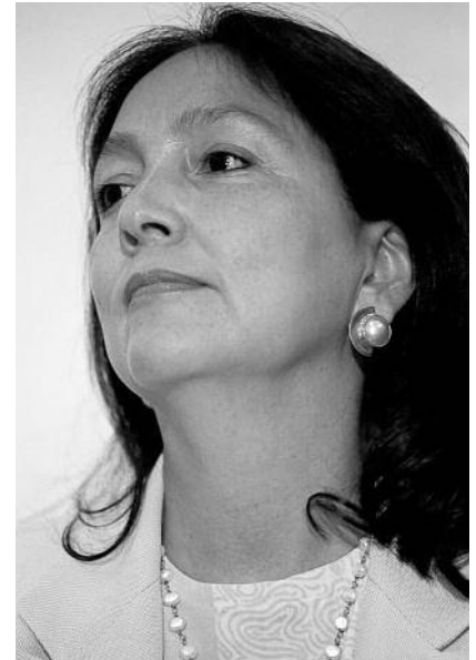
Amalia García, president of the PRD.

How can we characterize today's party system in Mexico? This is one of the central questions guiding academic thinking in Mexico about political parties. The deconstructing of the hegemonic-party system has given rise to a new system that has not yet consolidated. The emergence of new parties during the 2000 presidential elections —some the result of splits in the Institutional Revolutionary Party (PRI) or the Party of the Democratic