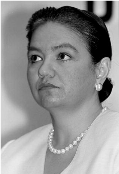
Dulce María Sauri, president of the PRI.